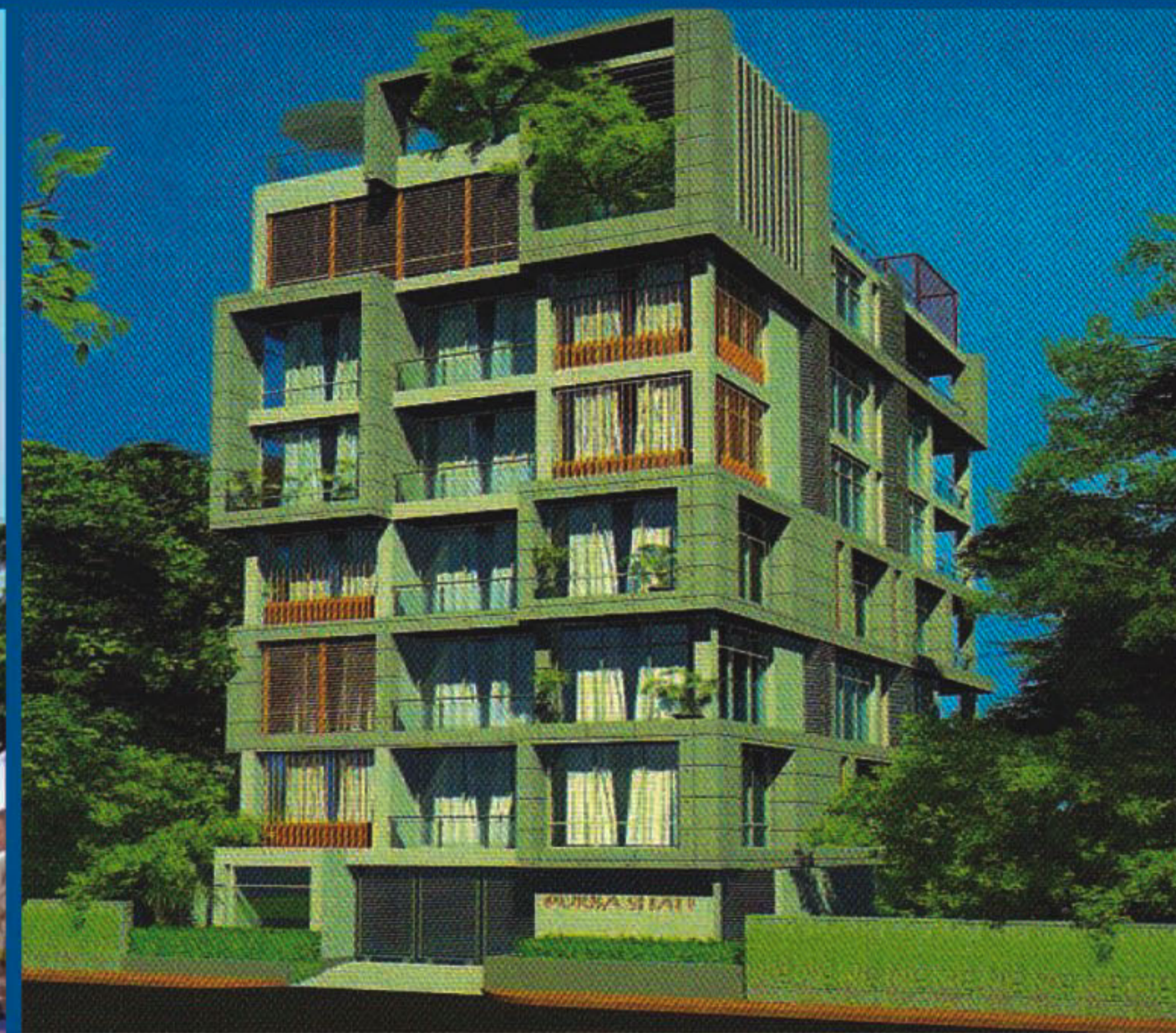
Purba Shafi Mirpur DOHS, Dhaka | 2150 sq-ft 3 Bedrooms with bath