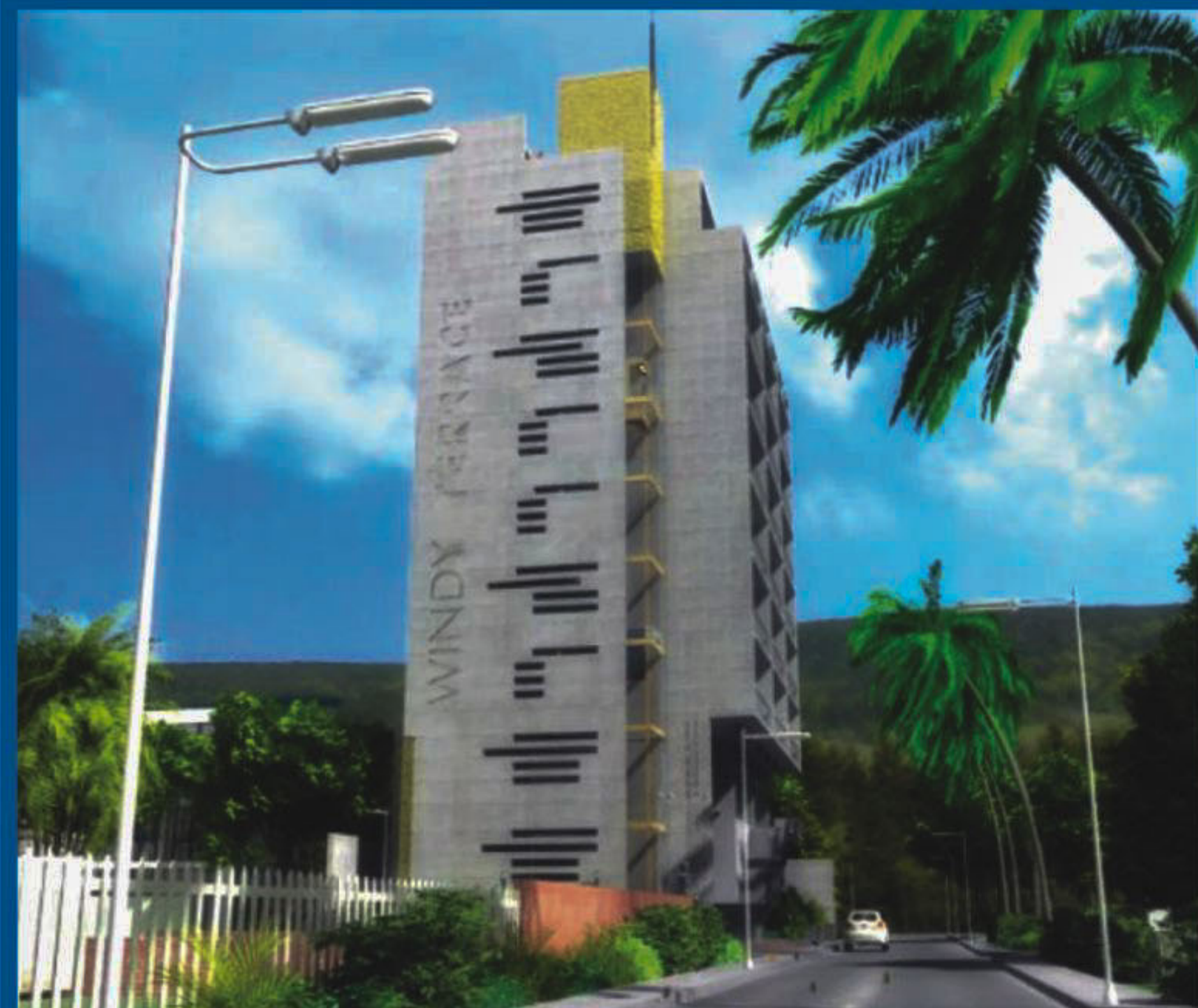
Windy Terrace Kolatali, Cox's Bazar | 50 (Fifty) Service Apartment & Rooms