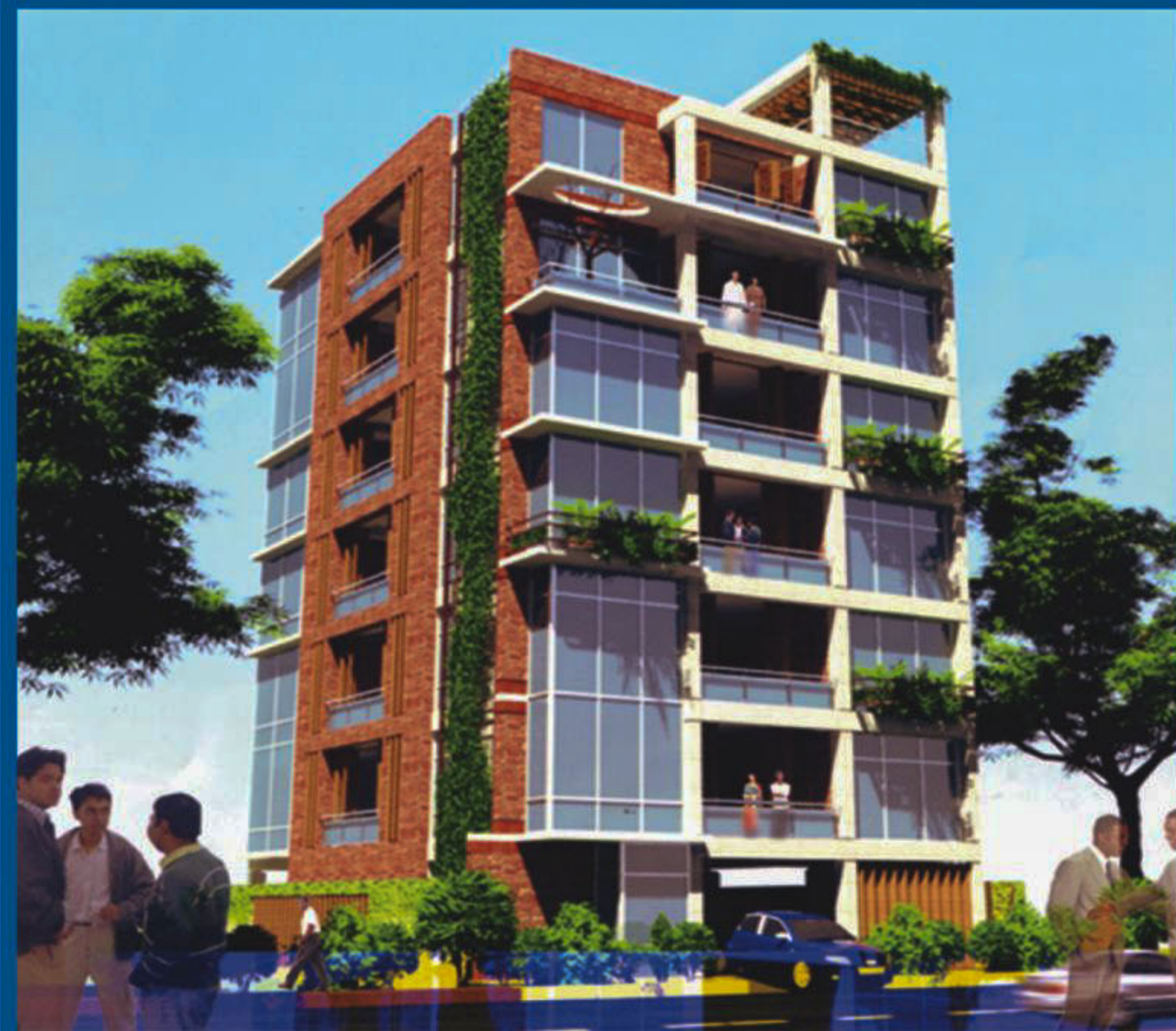
Purba Dakhina Mirpur DOHS, Dhaka | 2150 sq-ft 4 Bedrooms with bath