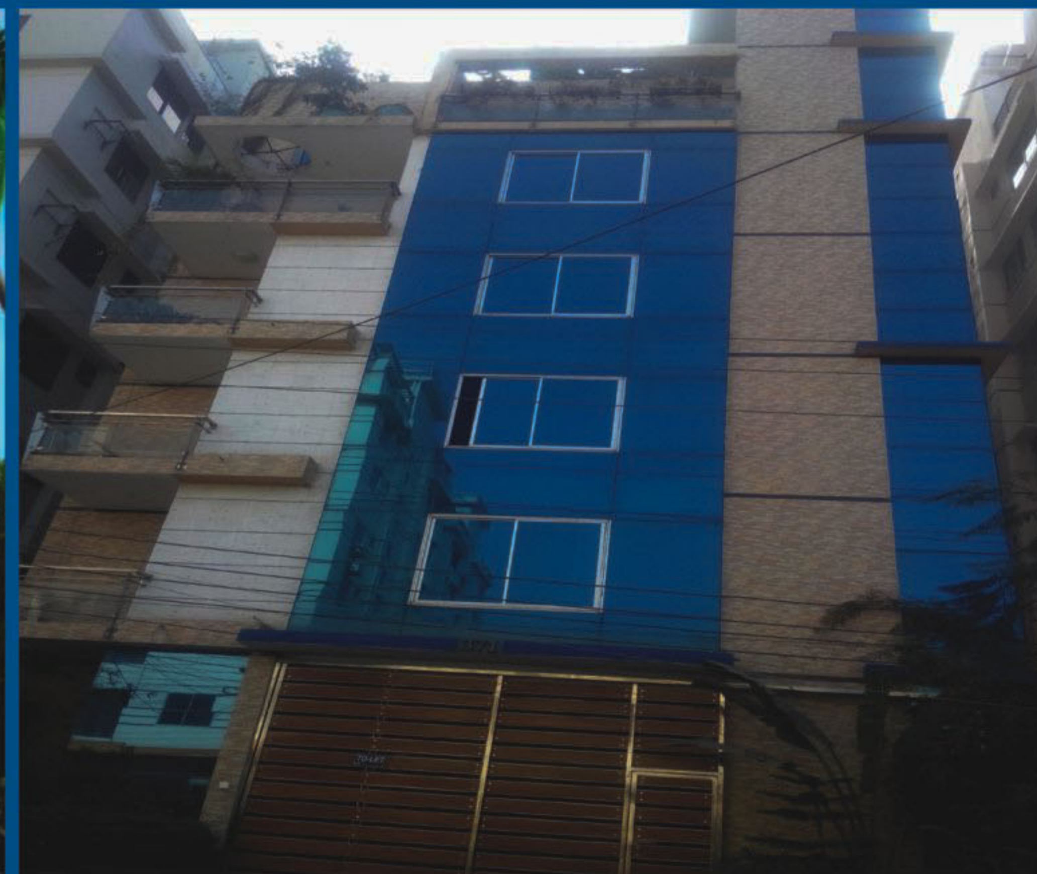
House-371, Road-6 Mirpur DOHS, Dhaka