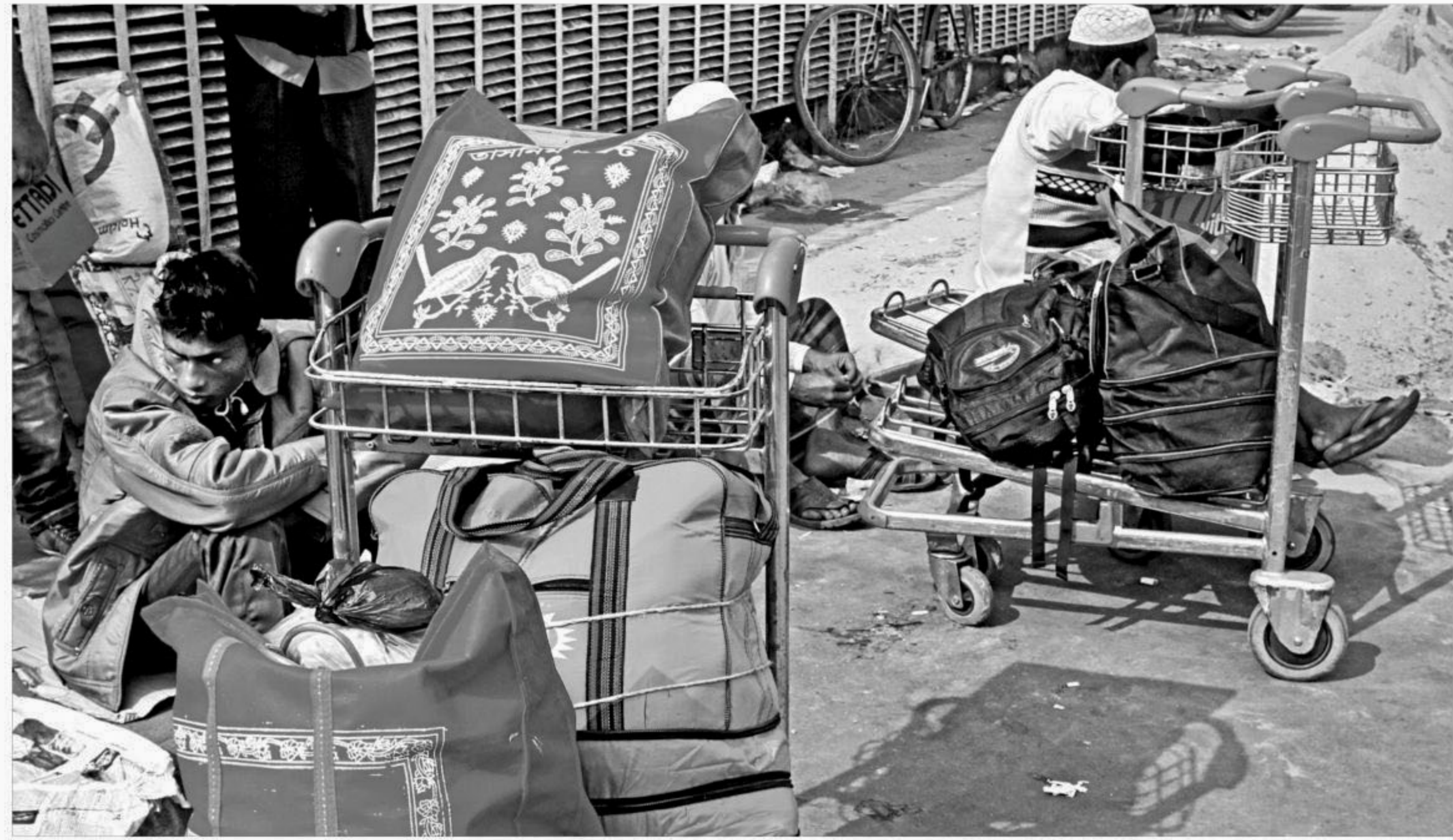
These people arriving from Kuwait say they have been forced to stay right on the street before the capital's Hazrat Shahjalal International Airport for the last two days due to exorbitant fares being charged by drivers of private vehicles running on hire. The drivers, they say, try to justify taking advantage of others' misfortune saying that they were "braving any possible violence" centring the ongoing countrywide blockade being enforced by the BNP-led 20-party alliance.