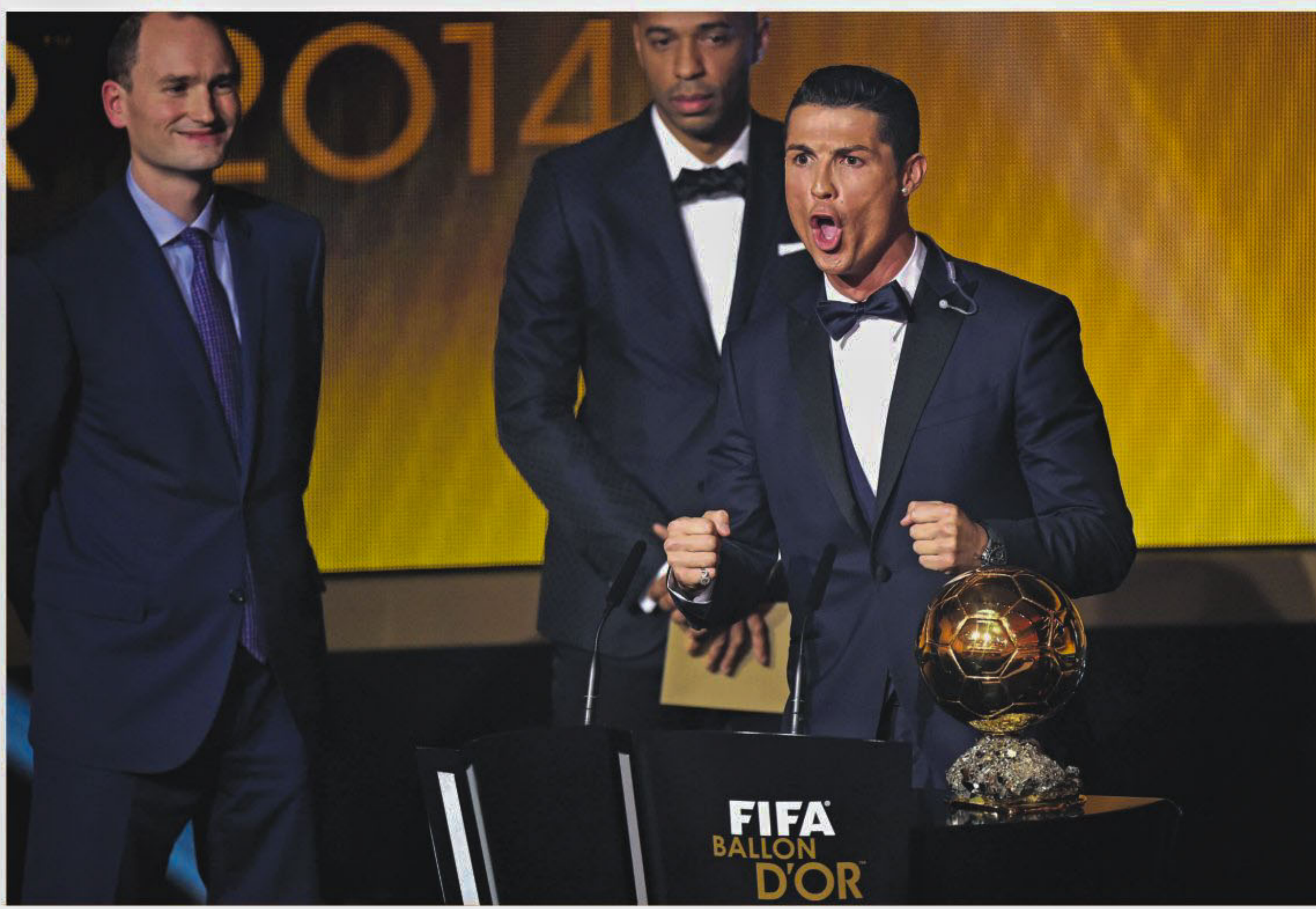
Real Madrid superstar Cristiano Ronaldo lets out a roar after winning his third Ballon d'Or award at Madrid yesterday. He beat Lionel Messi for the second consecutive year.