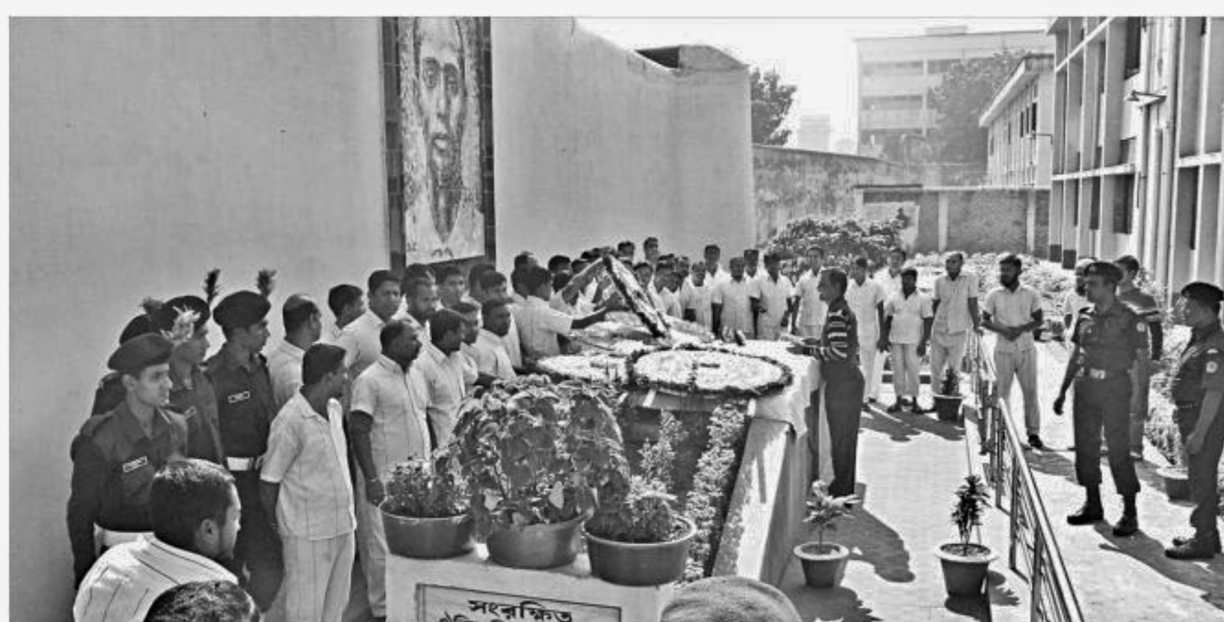
Prisoners and officials lay wreaths at the gallows where anti-British revolutionary Masterda Surya Sen was hanged in 1934, inside Chittagong Central Jail yesterday. Separately, Bangladesher Samajtantrik Dal, Samajtantrik Chhatra Front, Surya Sen Pathagar, and Charon Sanskritik Kendra paid floral tributes at his statue on JM Sen Hall premises in Chittagong city. It was the 81st anniversary of his execution, for leading the 1930 Chittagong armoury raid.

Sponsored by Grameenphone, 65,000 books will be given to students of about 1,500 schools of the three cities, said the litterateur.