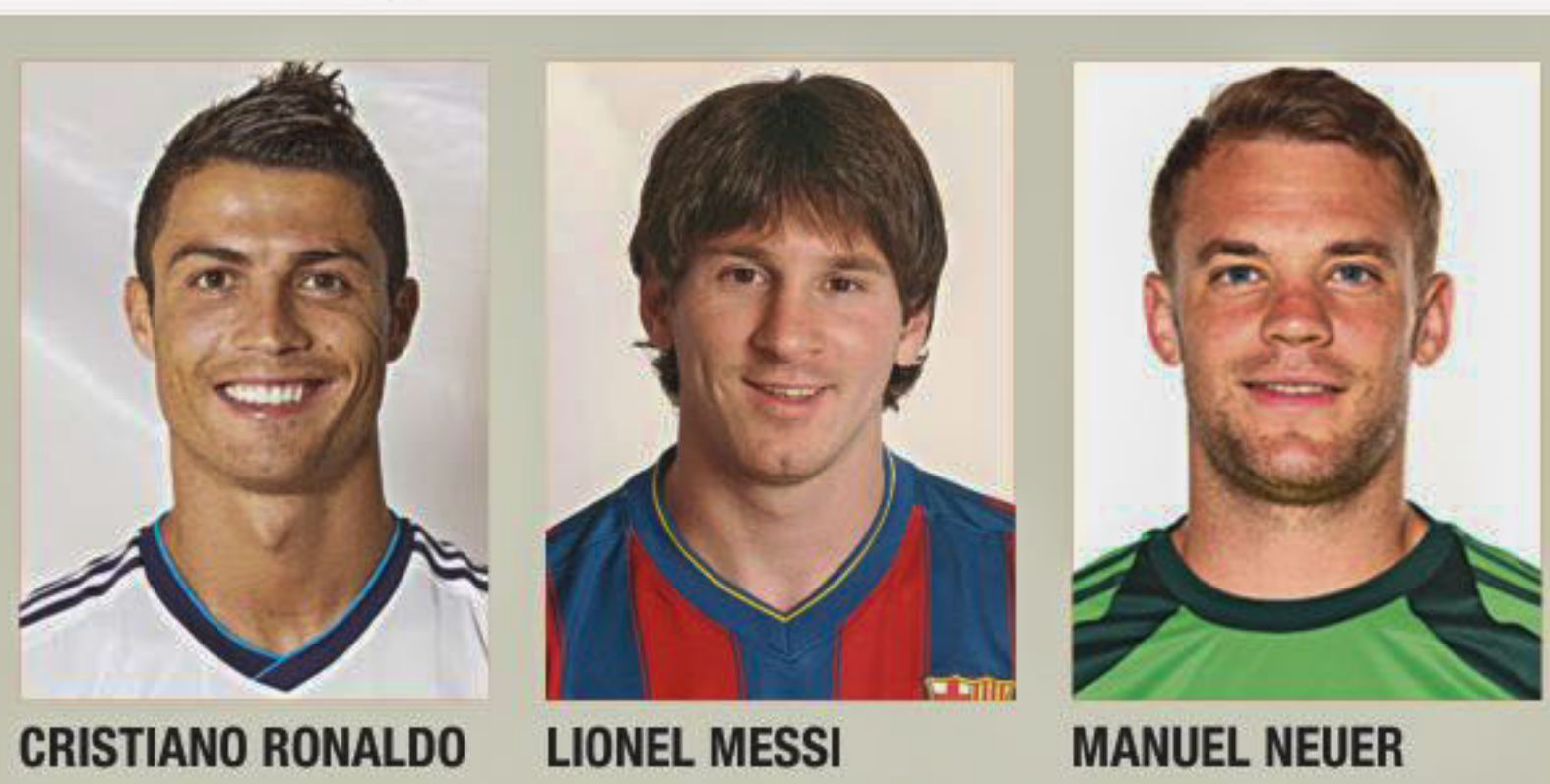
CRISTIANO RONALDO LIONEL MESSI MANUEL NEUER

However, Neuer -- the only one of six German World Cup winners on the initial shortlist to make the final three -- makes a good case to become the first