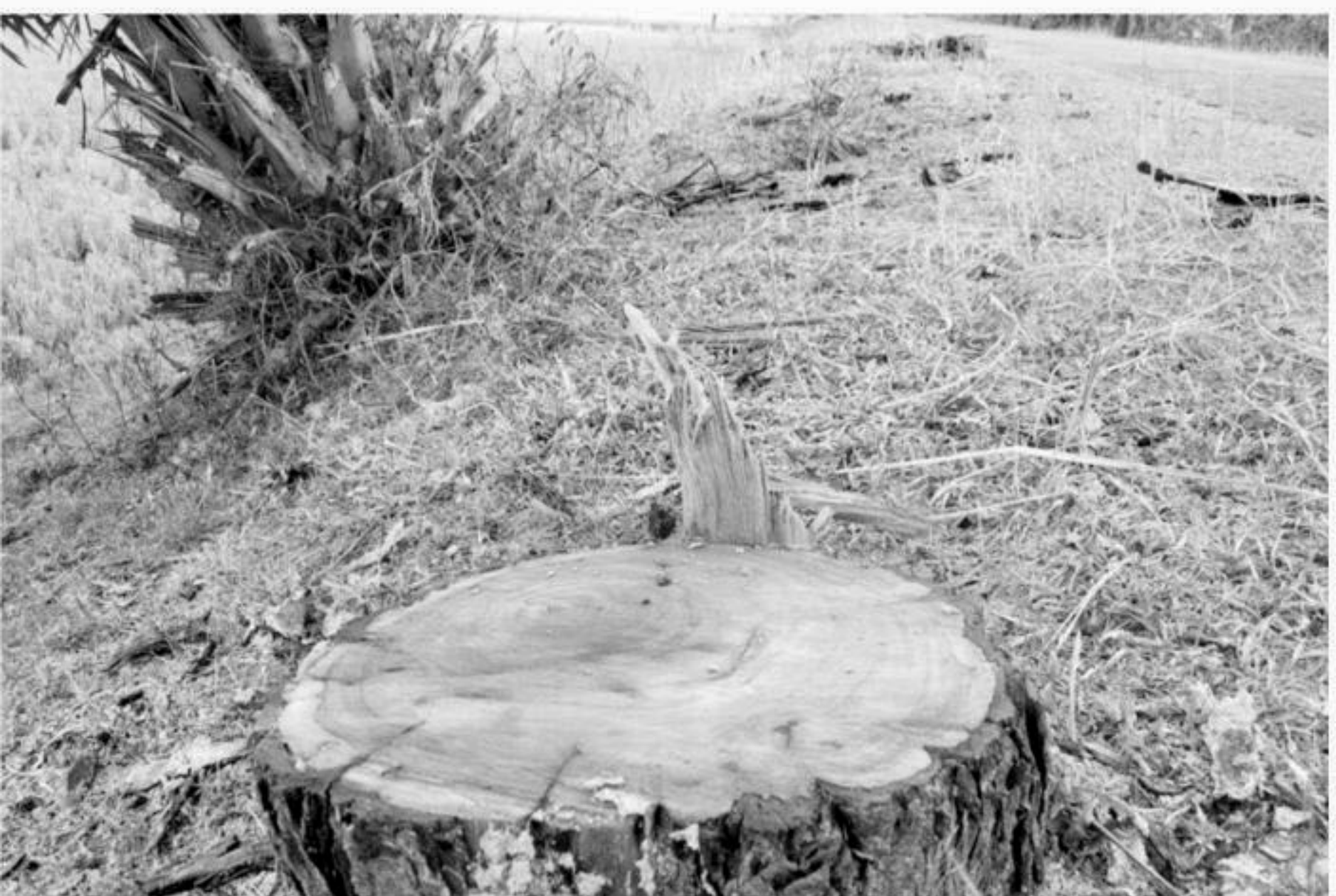
Remains of trunks bear testimony to illegal felling of the trees beside Kalapara-Kuakata alternative road in Baliatoli area of Kalapara upazila under Patuakhali district during the last three days. The forest department planted the trees 15 years ago.

Later, the indigenous people submitted a memorandum to the deputy commissioner to take immediate steps to bring the offenders to book.