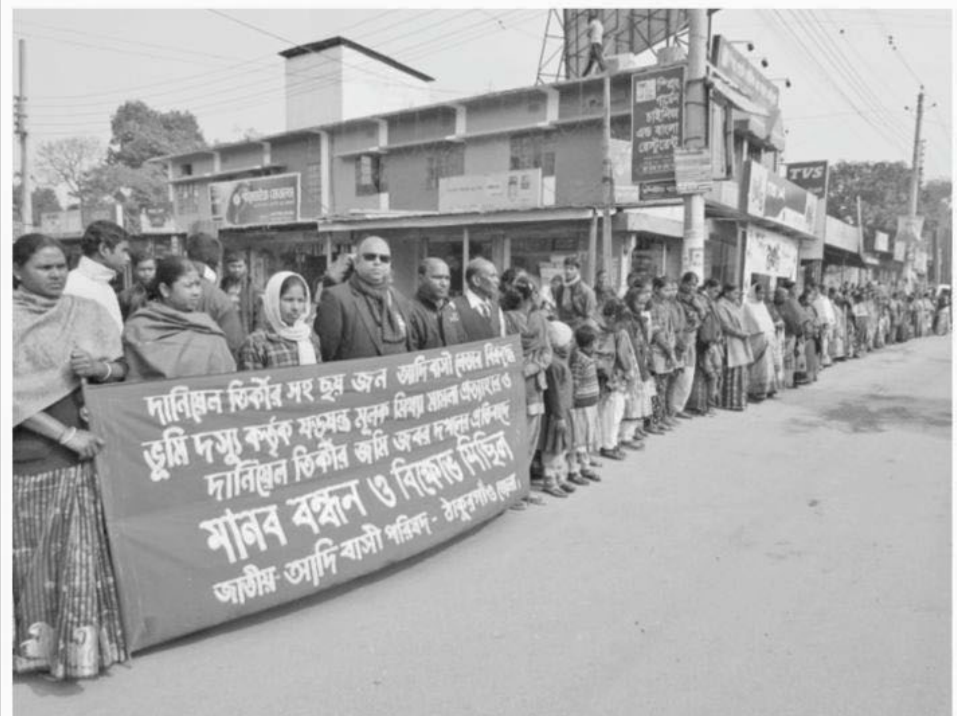
Jatiya Adivasi Parishad forms a human chain in front of Samobaya Market in Thakurgaon town yesterday demanding withdrawal of a false case filed by land grabbers against six indigenous people of Gobindanagar in Thakurgaon municipality.