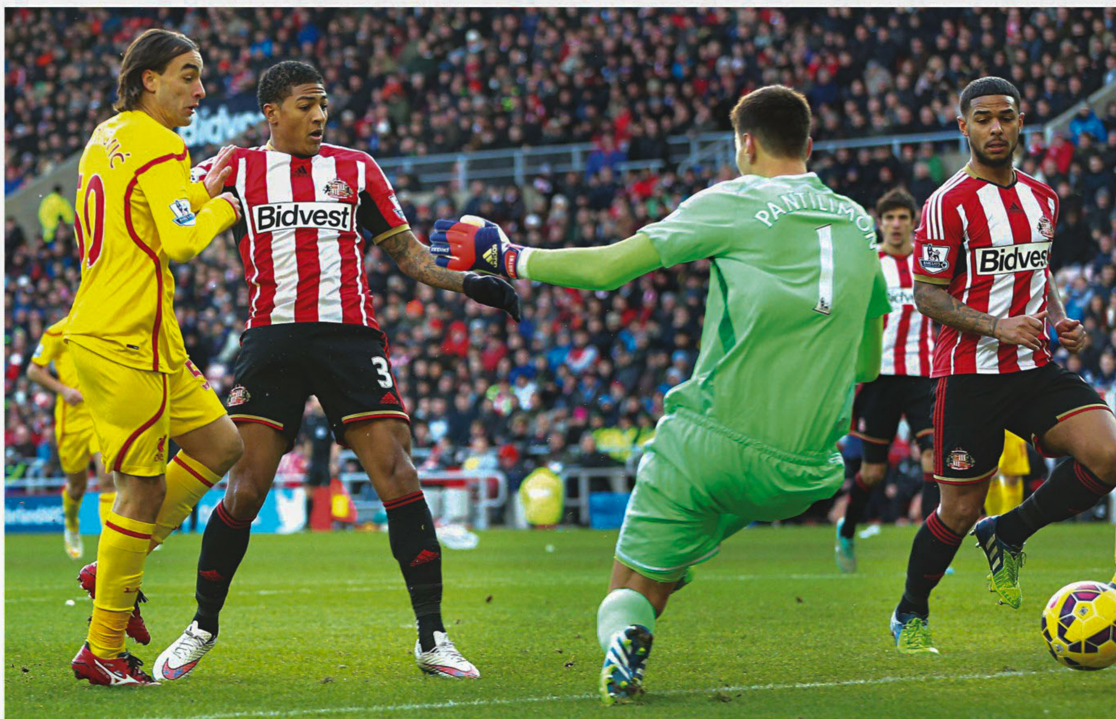
Liverpool midfielder Lazar Markovic (L) scores the all-important goal against Sunderland during their Premier League encounter at the Stadium of Light yesterday.

"I continue to be concentrated and motivated. There is nothing that will distract me," Luis Enrique added.