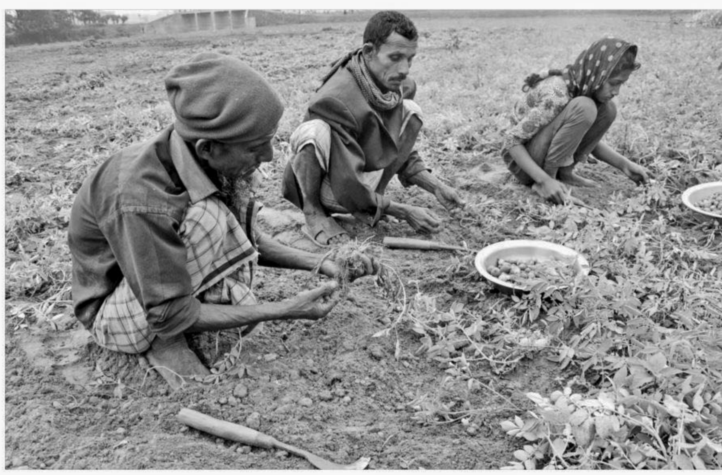
Farmers of Goforgaon in Mymensingh harvesting the first batch of red potatoes. Last year potato growers suffered losses due to low prices, triggered by a sudden supply glut in the wake of weeks of shutdowns and blockades. The photo was taken on Friday.

More than 200 registered participants comprising scientists, environmental experts, activists and government officials took part in the conference with 14 co-organisers including public and private universities and 75 associate organisers.