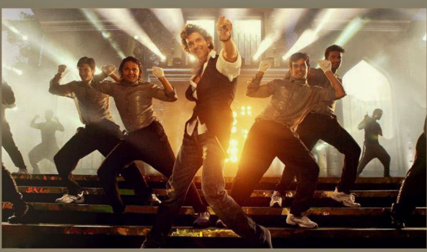
FIND FIVE DIFFERENCES BETWEEN THE TWO PICTURES FROM "BANG BANG"

Send "ALL FOUR" answers to showbiz.tds@gmail.com Winners will receive QUEEN SPA ROOM GIFT VOUCHER courtesy of Queen Bella ALL 4 QUESTIONS MUST BE ANSWERED CORRECTLY