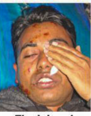
The injured magistrate