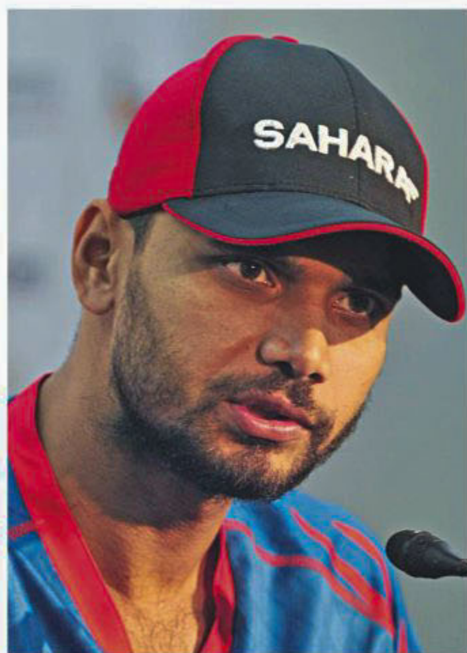
MASHRAFE BIN MORTAZA

Mashrafe said that it's difficult but not