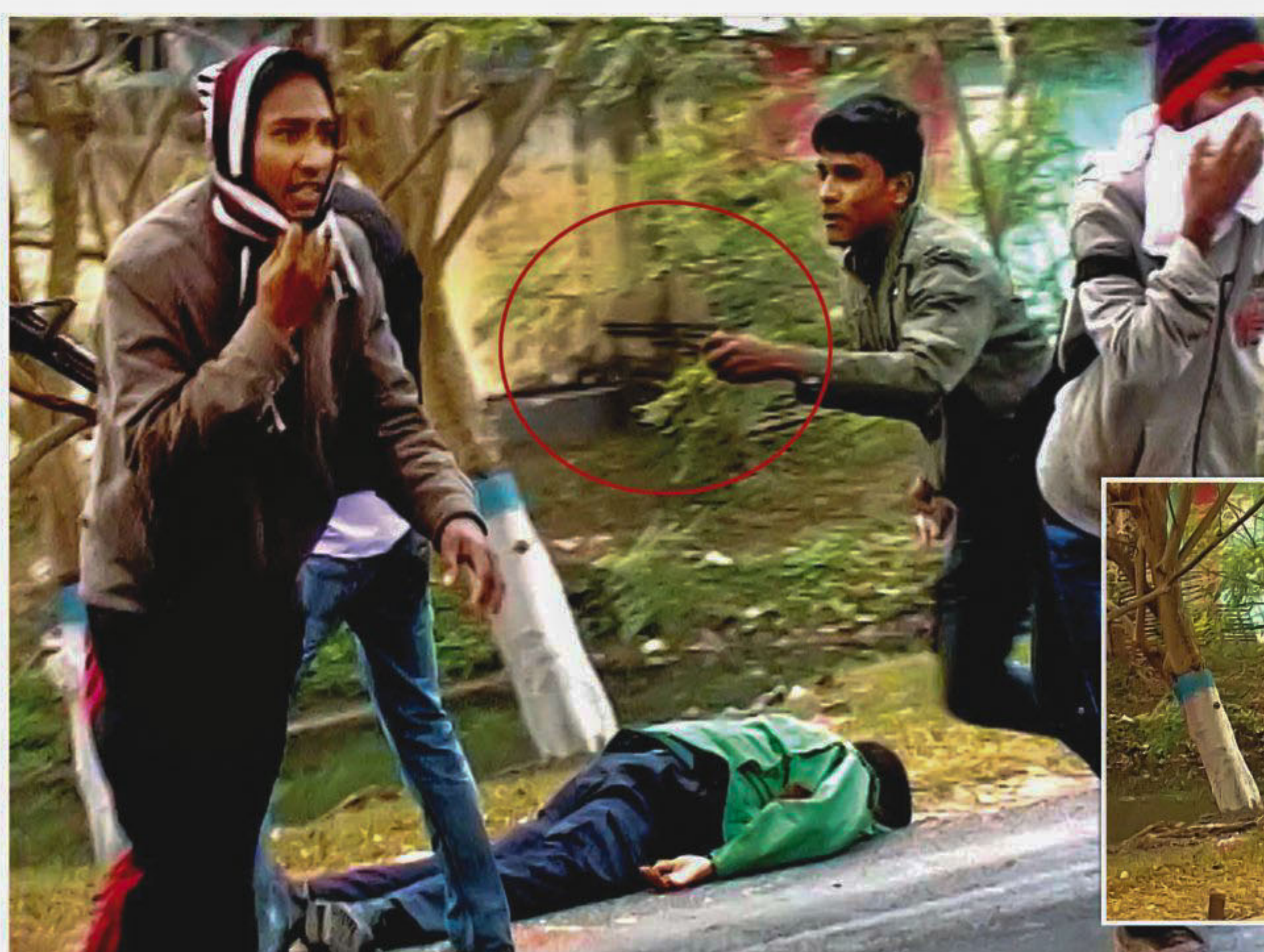
Jamaat-Shibir men beating up a policeman on Rajshahi-Naogaon highway with the gun snatched from him, inset, in Rajshahi. A gun-toting Shibir man runs to attack the other cop after neutralising one.

Besides, oil tanker and coastal ships will be barred from using the route. SEE PAGE 10 COL 1