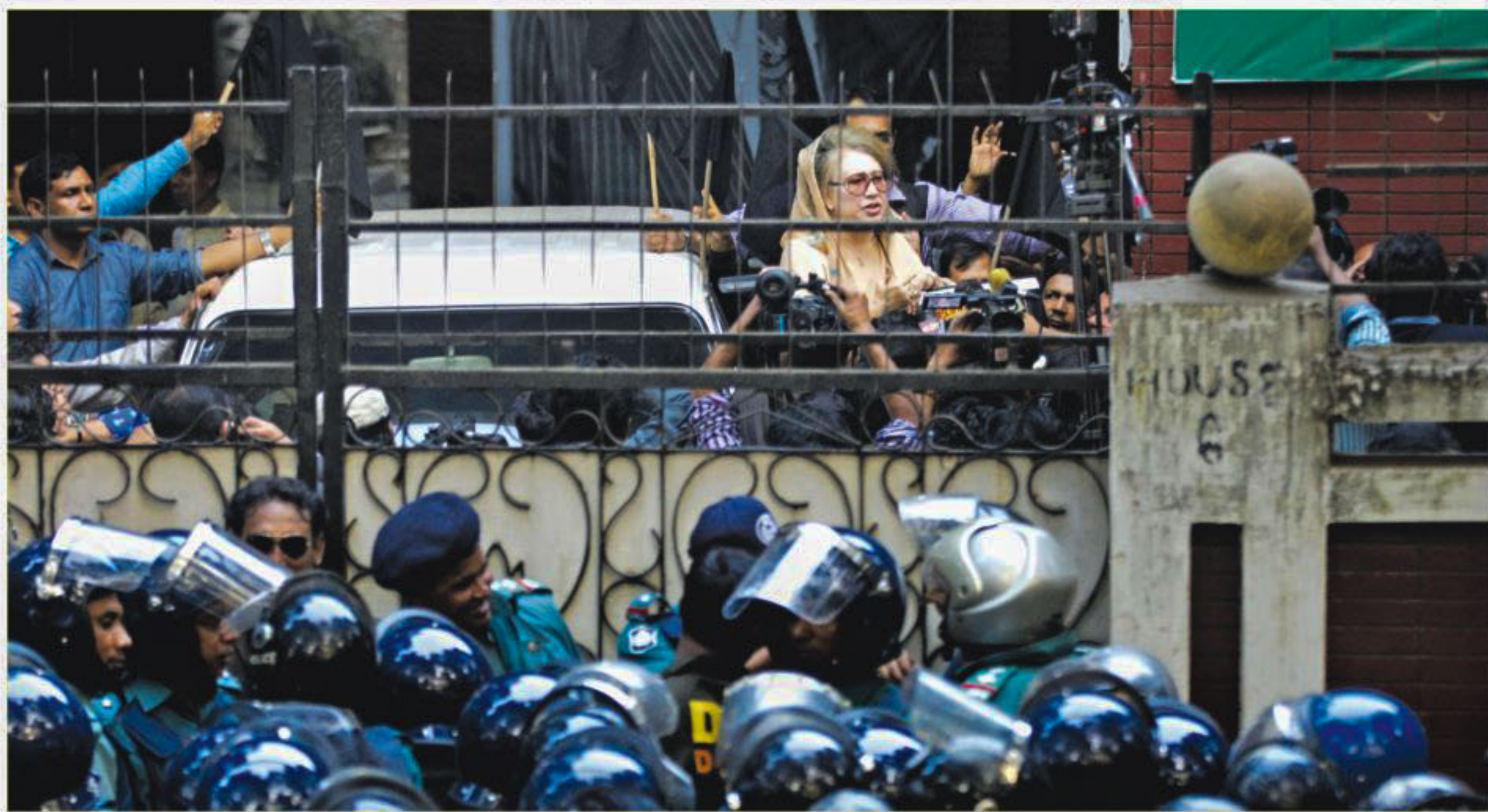
Confined to her Gulshan office since Saturday night, BNP Chairperson Khaleda Zia speaks to her party men and the press yesterday from inside the office premises, cordoned off by law enforcers.

BNP chief Khaleda Zia yesterday called a countrywide blockade for an indefinite period from today to protest the government's not allowing her party and allies to hold rallies in the capital and elsewhere. Having been confined to her Gulshan office since Saturday midnight, Khaleda made several efforts to come out yesterday afternoon, but law enforcers locked the main gate from outside and stood guard in several layers. Cops also used pepper spray to disperse the party leaders and activists waiting inside the gate. Several BNP leaders and journalists were injured in the police action. BNP leaders said Khaleda wanted to go to the party's central office at Nayapalton, where leaders and activists were asked to gather for holding a rally to denounce the January 5 one-sided parliamentary election. The opposition party, which boycotted the polls last year, dubs the day as the "Democracy Killing Day". After the police action, the former prime minister announced the blockade of roads, railways and waterways