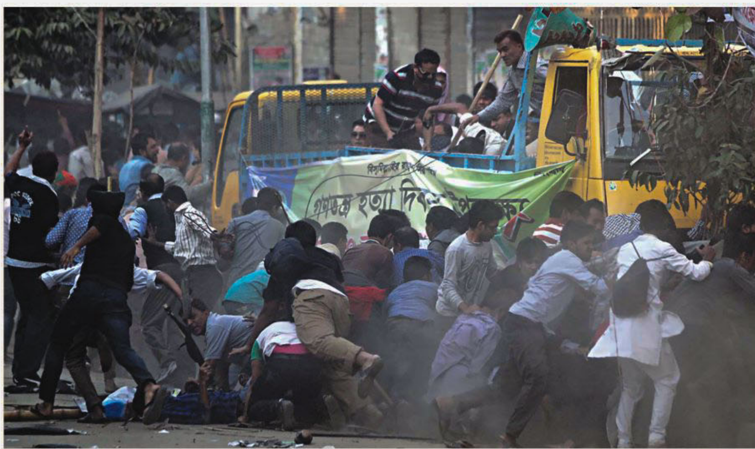
Activists of the 20-party combine run for cover during a clash with police at the venue of a "Democracy Killing Day" rally on Nur Ahmed Road in Chittagong yesterday.

A standoff between pro- and anti-government journalists at the Jatiya Press Club yesterday resulted in BNP acting secretary general Mirza Fakhrul Islam Alamgir taking cover inside the club. Since yesterday afternoon, the BNP leader had been there as of 2:15am today. The trouble began when Fakhrul came out of a programme in the club and the pro-government journalists chased him back inside. The situation had calmed down a little with