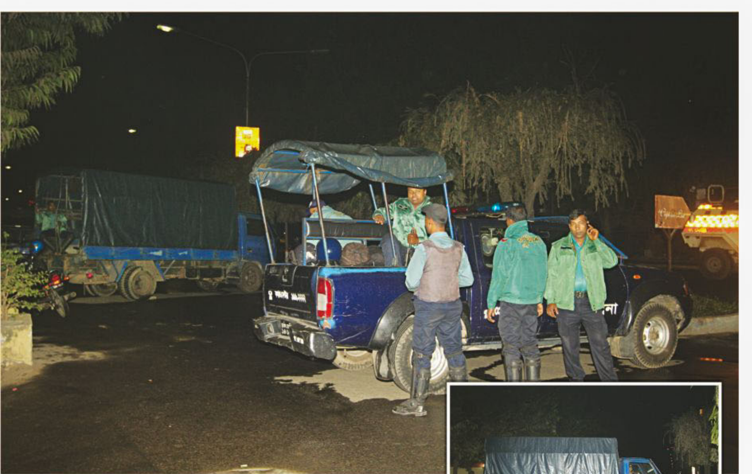
In the wee hours of today, some policemen are seen in and around their van at the intersection of Gulshan Avenue and the street in front of BNP chief Khaleda Zia's residence. Inset, a police truck is parked on Gulshan Avenue blocking the street.

The Daily Star office will remain closed today on the occasion of Eid-e-Miladunnabi. Therefore, there will be no issue of the newspaper tomorrow.