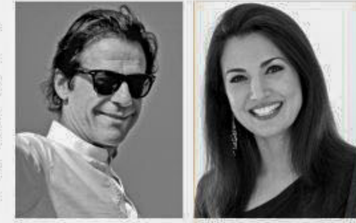
Imran Khan Reham Khan

Cricketer-turned-politician Imran Khan has secretly married a former BBC anchor Reham Khan in a hush hush wedding, according to media reports.