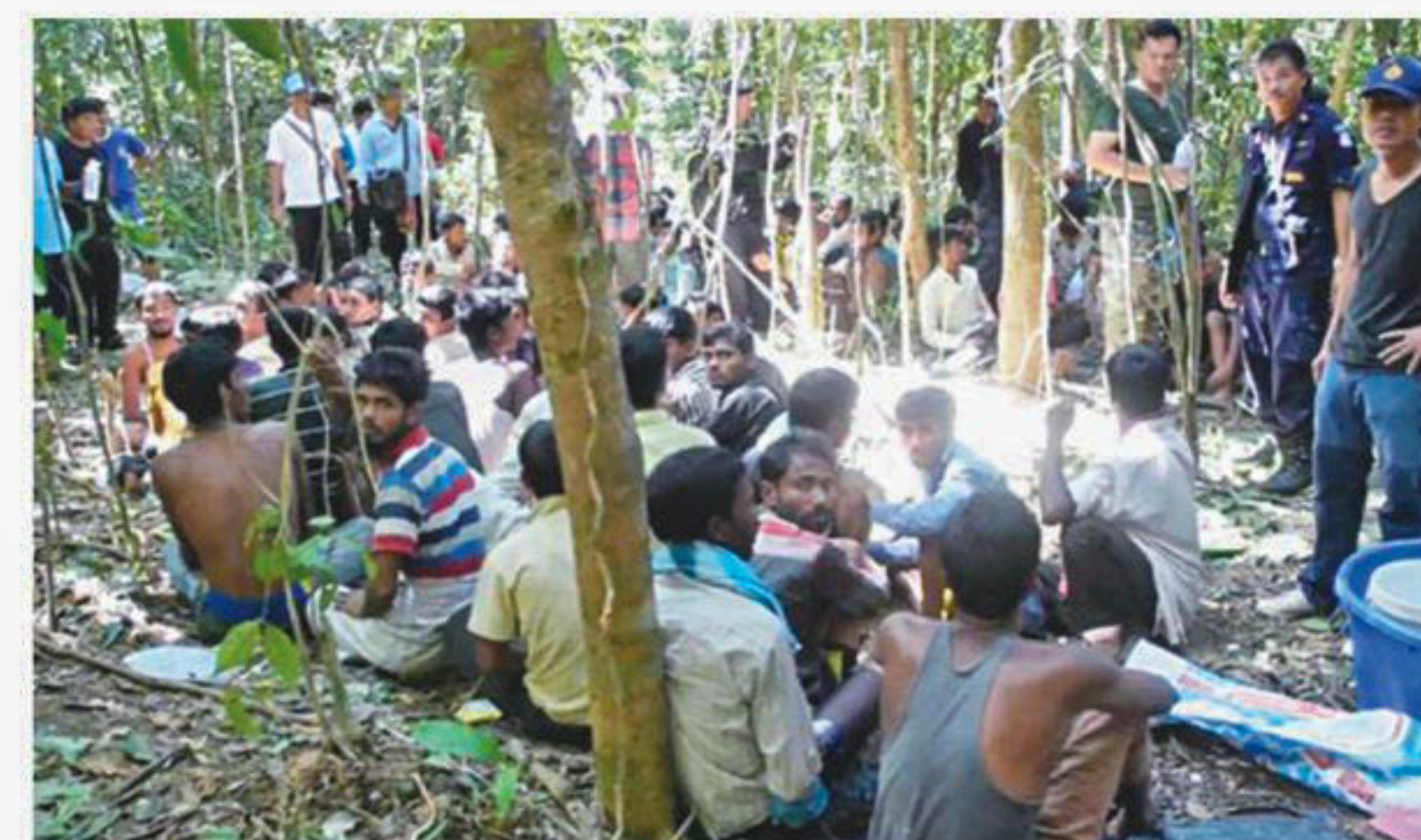
On 18 October last year, a shocking BBC report revealed how dozens of Bangladeshis have been rescued after being abducted and shipped to Thailand to be sold as slaves.