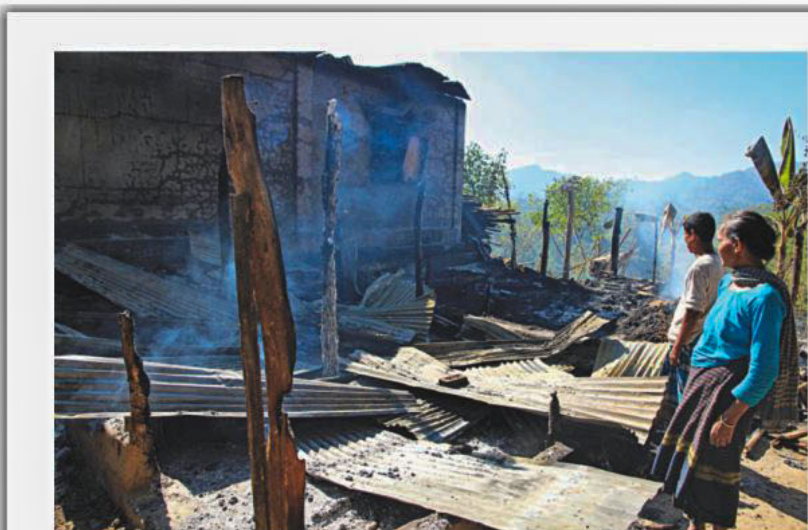
On 16 December 2014, when whole country was celebrating the victory day of the country, indigenous houses and shops were burnt down by Bengali settlers in Bagachari area under Burighat union of Naniarchar upazila in Rangamati district.