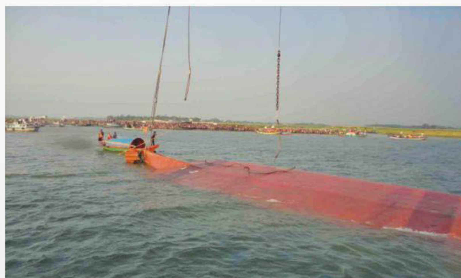
On 15 May 2014, the double-decker ferry MV Miraj-4 capsized in the Meghna River. During the time of sink there were some 150 to 200 people on board.