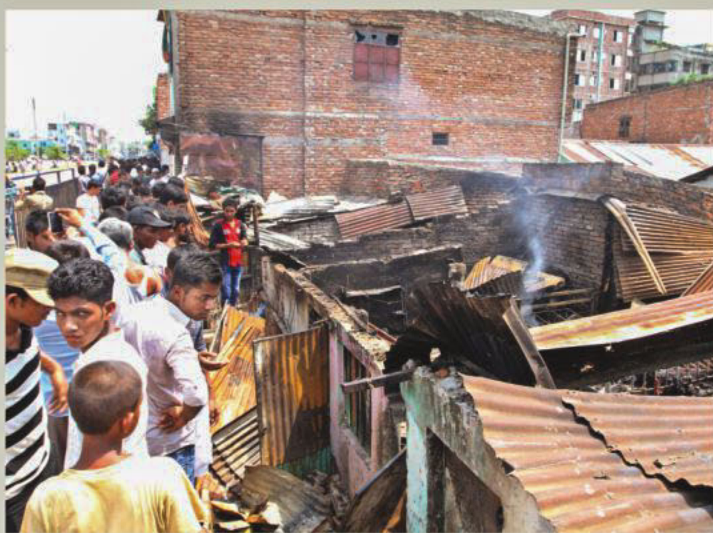
On June 13 last year at least nine people including eight members of a family were burnt alive as locals set several houses on fire at Kalshi Bihari camp in city's Mirpur area.