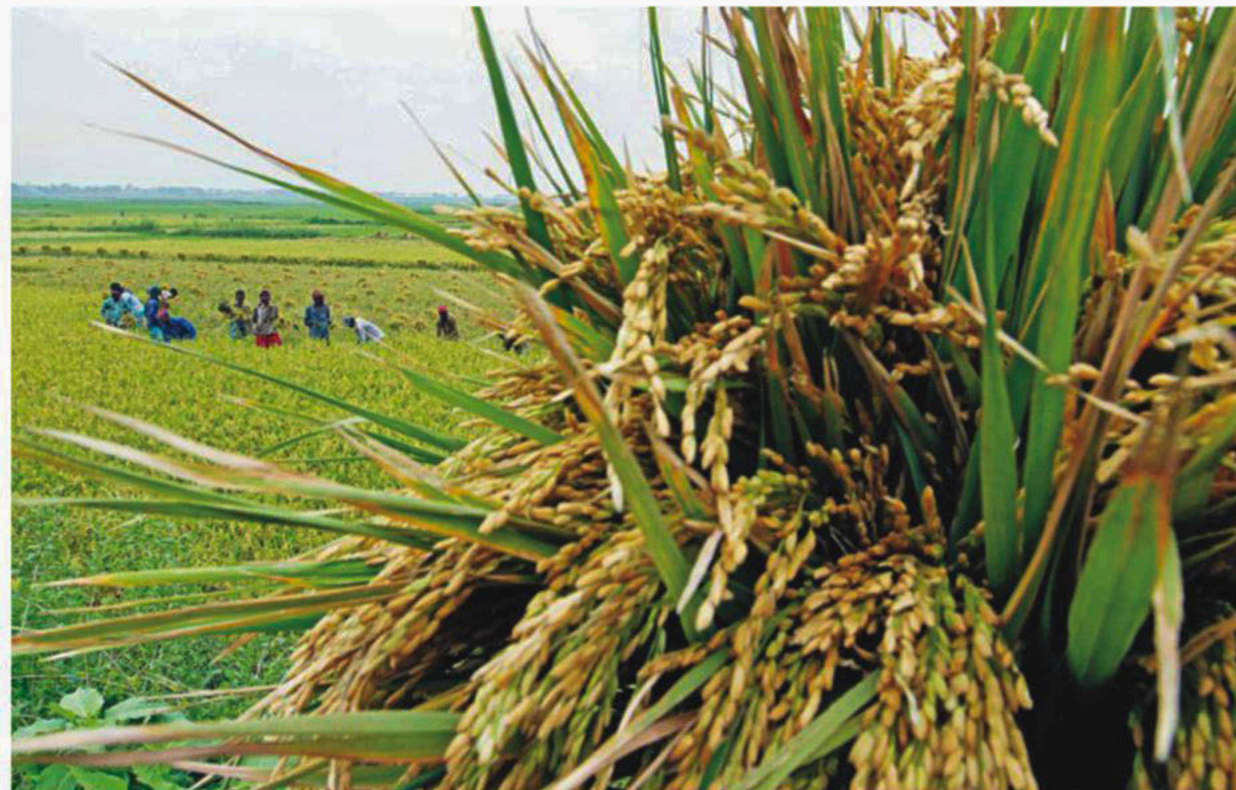
A new high-yielding rice variety rich with higher zinc content has been officially released to farmers for growing from the next Boro season. Bangladesh Rice Research Institute (BRRI) breeders developed the high-zinc rice varieties.