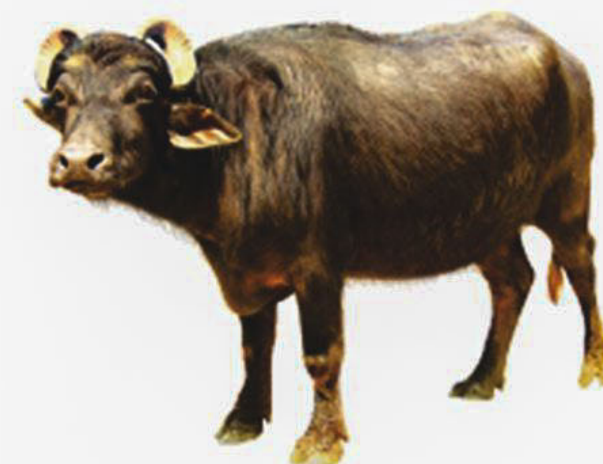
A Bangladeshi company, LaTeer Livestock Limited, and Beijing Genomics Institute (BGI) jointly unravelled the complete genome of water buffalo, opening up a new horizon in developing better breeds of the animal that is vital for milk and meat.