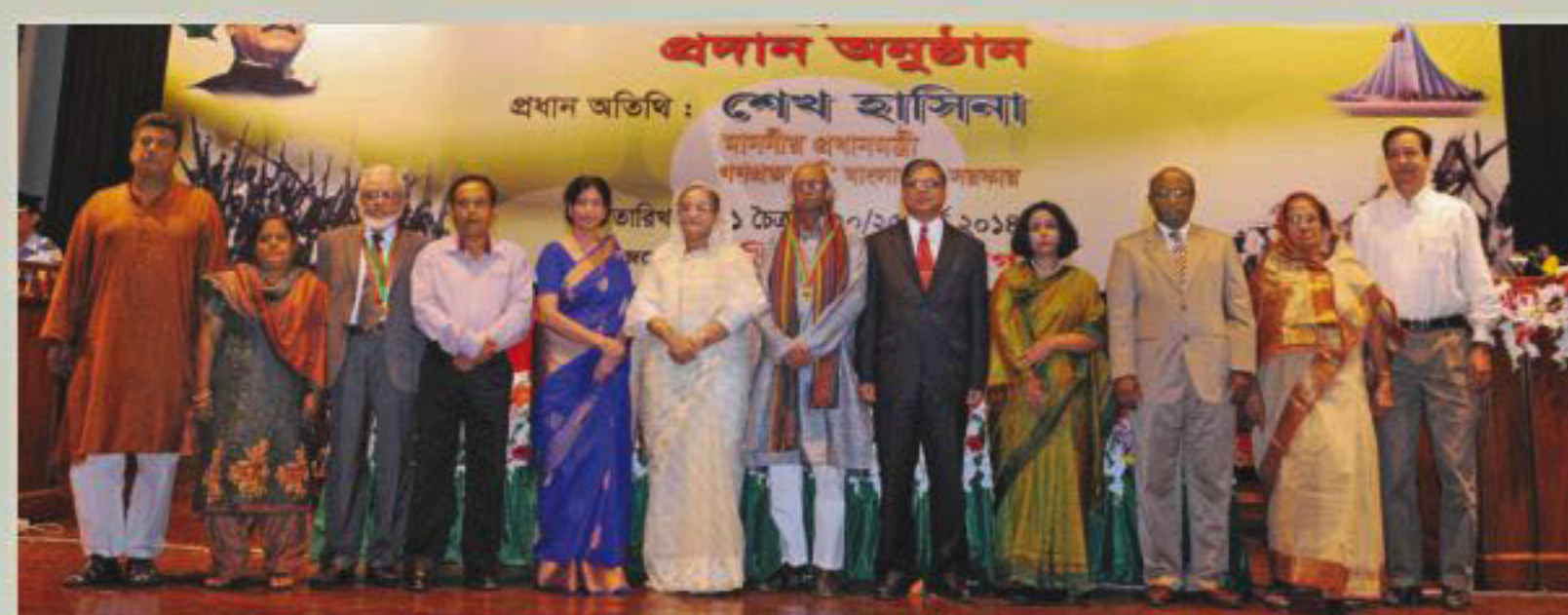
Nine prominent persons and a state-run organisation were awarded the Shadhinata Padak, the highest state award for contributions to society.