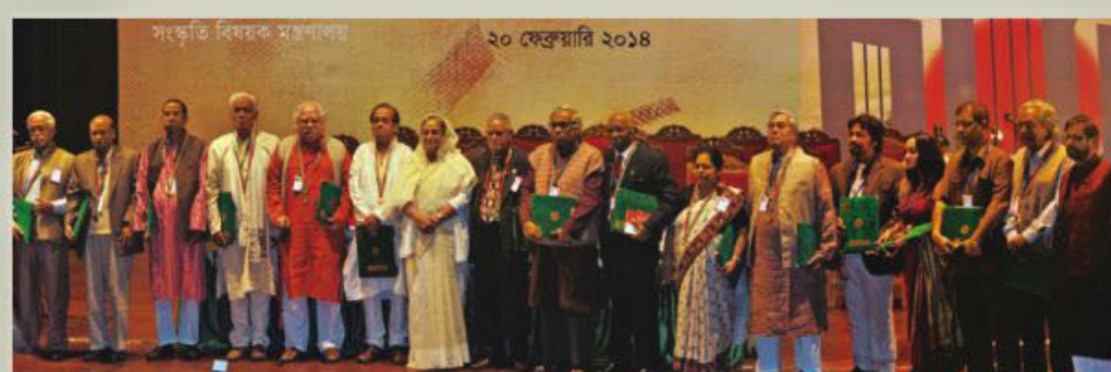
Fifteen eminent personalities received the prestigious Ekushey Padak in recognition of their contributions in respective fields.