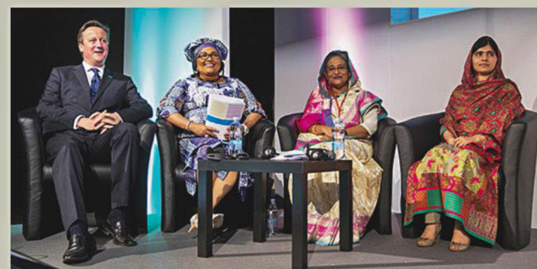
The Bangladesh Premier visited the UK at the invitation of UNICEF Executive Director Anthony Lake. She also attended the first-ever Girl Summit held there.