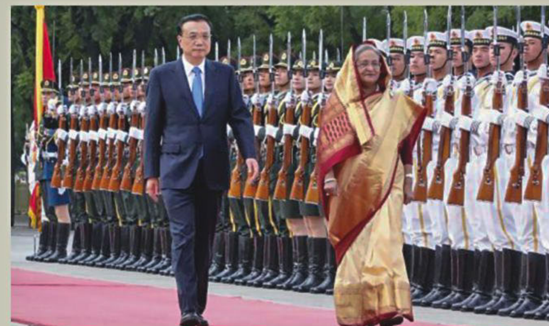
Prime Minister Sheikh Hasina paid an official visit to China from June 6 to 11, at the invitation of the Chinese Premier Li Keqiang.