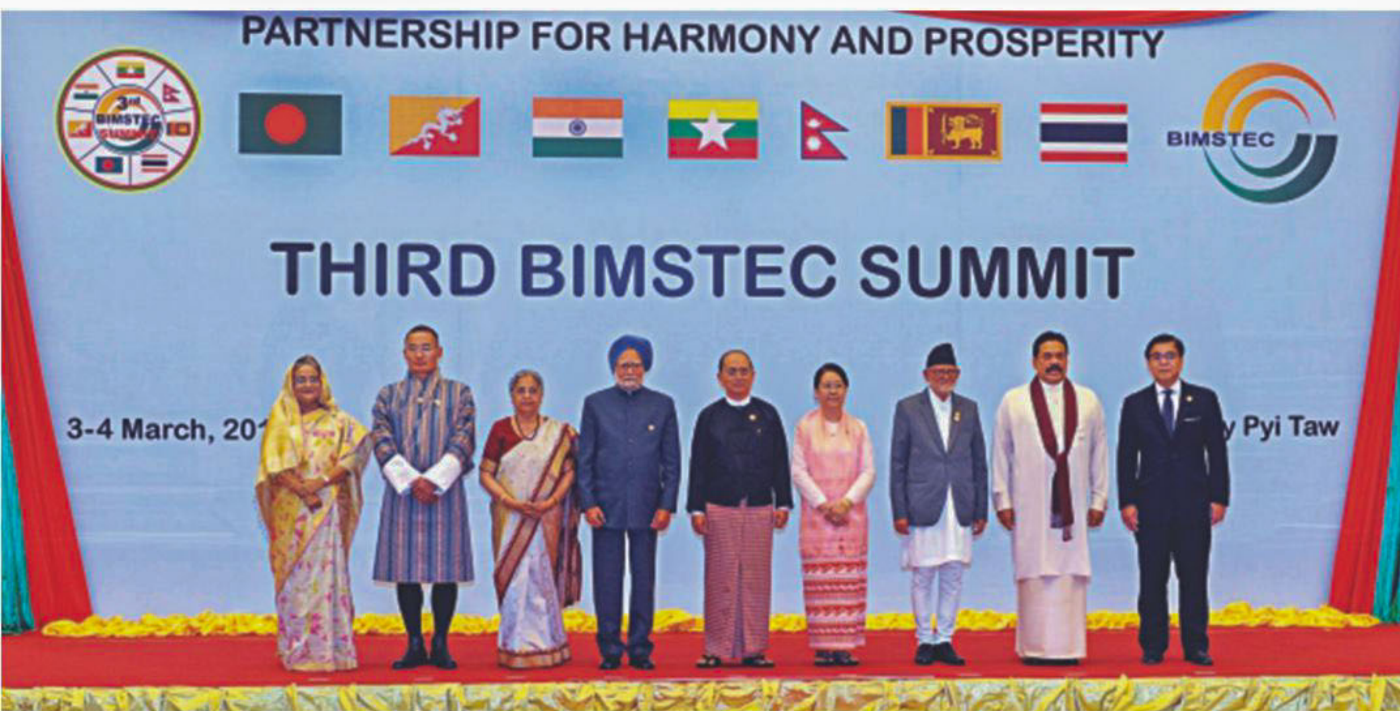
An agreement to set up a permanent BIMSTEC secretariat in Bangladesh endorsed more than two years ago has been realised.