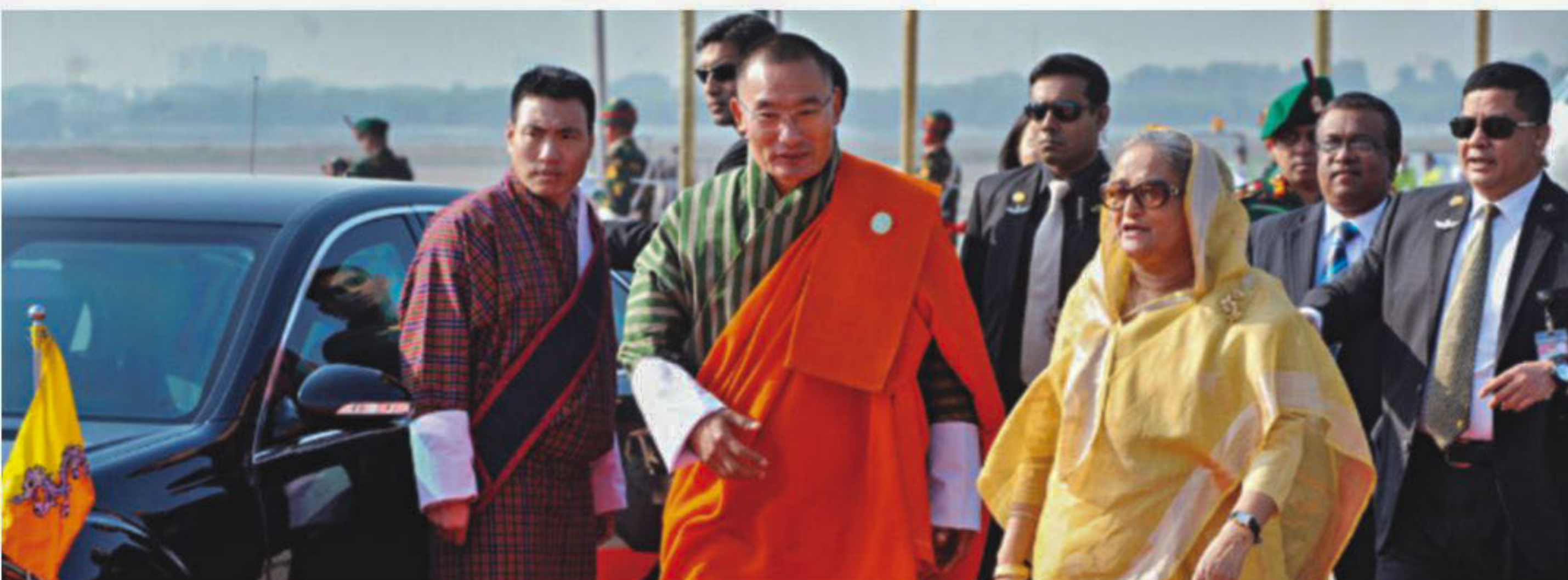
Bhutanese Prime Minister Tshering Tobgay paid a three-day visit to Dhaka at an invitation from his Bangladeshi counterpart.