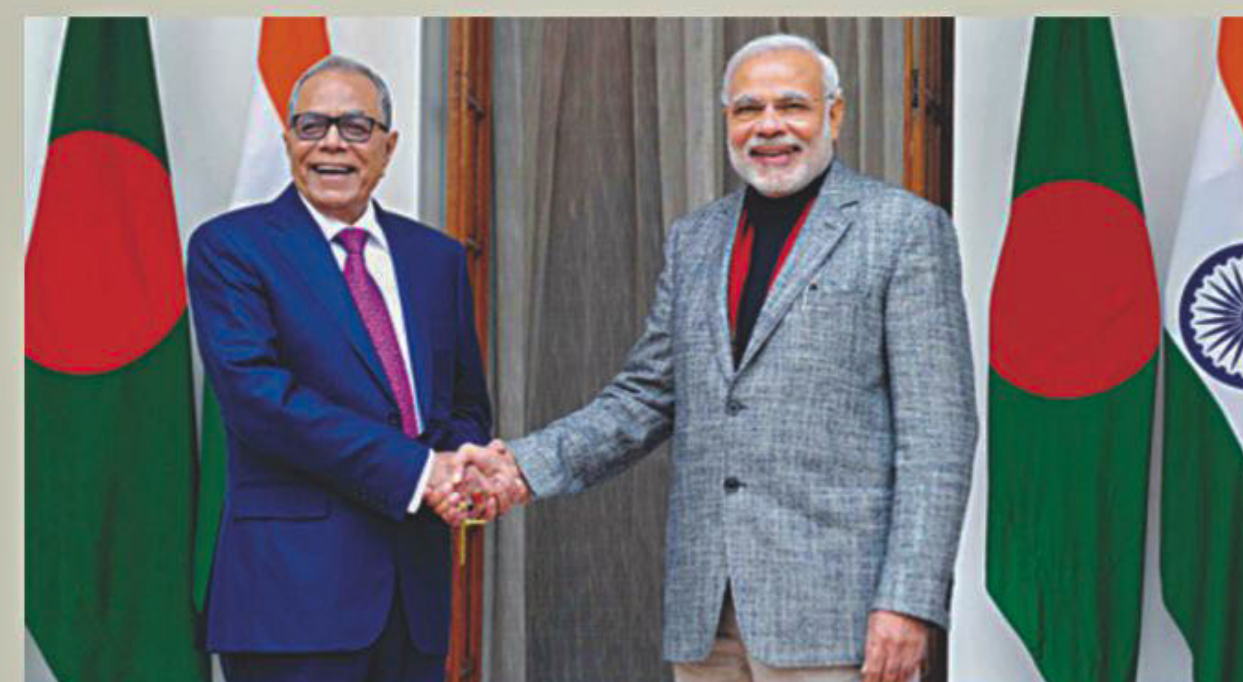
The Indian Prime Minister Narendra Modi called on Bangladesh President Abdul Hamid during the latter's six-day visit to India in December 2014.