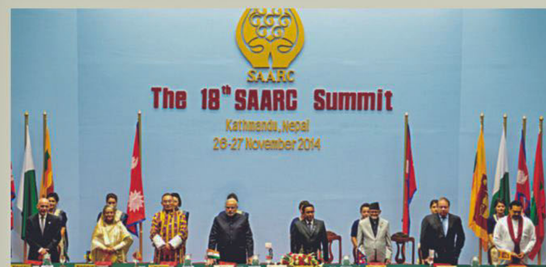
The eighteenth summit of 'South Asian Association of Regional Cooperation' (SAARC) was held in Kathmandu from 26 to 27 November 2014. The theme of the summit was Deeper Integration for Peace and Prosperity, focused on enhancing connectivity between the member states for easier transit-transport across the region. Foreign Ministers of the eight member states signed an agreement on energy cooperation namely 'SAARC Framework Agreement for Energy Cooperation'.