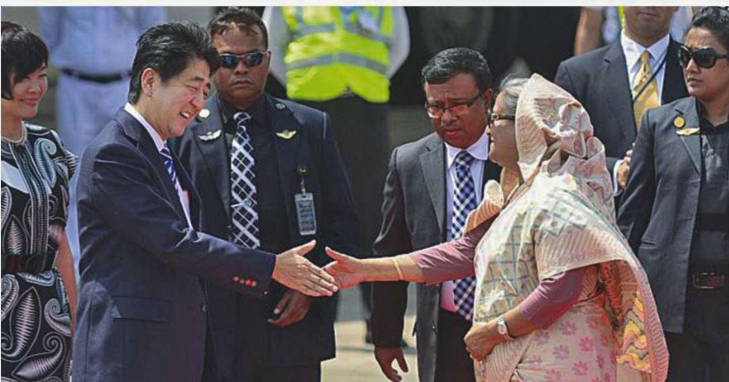
At the invitation of his Bangladeshi counterpart Sheikh Hasina, Japanese Prime Minister Shinzo Abe was on a two day goodwill visit to Dhaka from September 6-7.