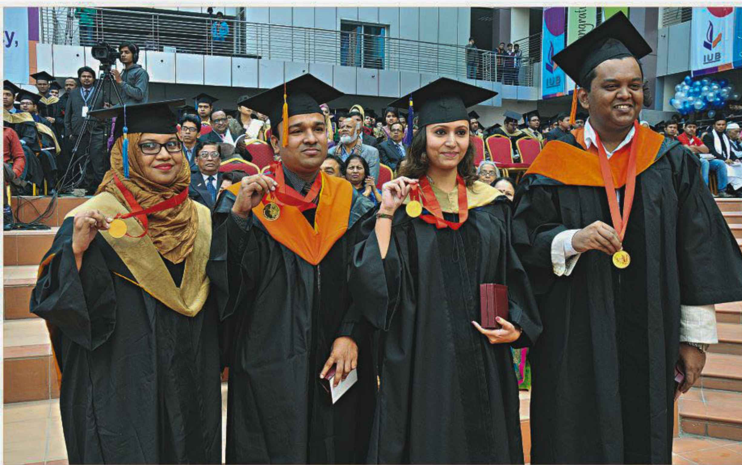
Recipients of the Chancellor's Gold medal at the 16th Convocation of the Independent University, Bangladesh (IUB).

The writer is a Communication Officer at BYLC.