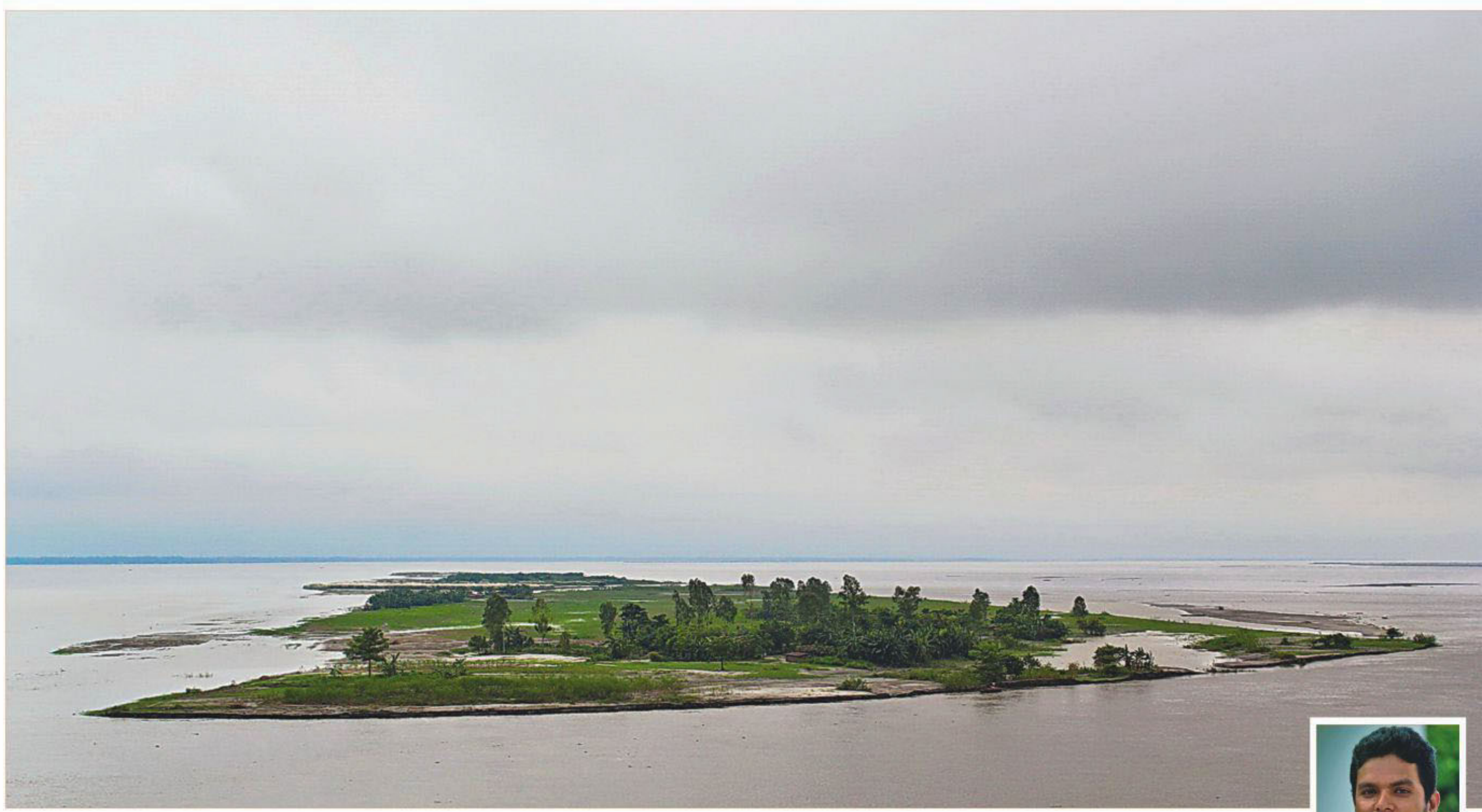
A verdant char settlement of the Jamuna in Sirjaganj captured during the monsoon flooding of 2014, by a finalist in the Rivers of Bangladesh category of The Daily Star's photo contest inPixel.