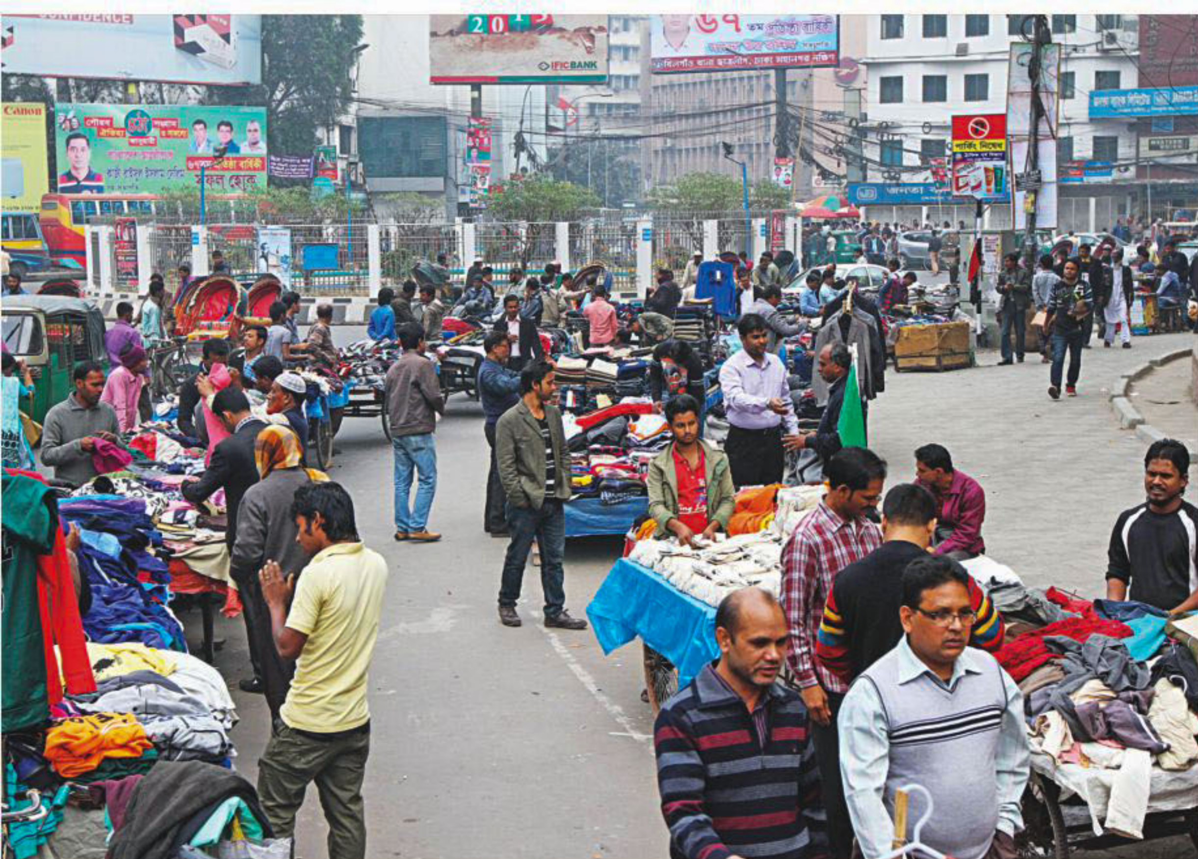
Hawkers carry out their trade occupying the road before the Jiban Bima Tower in the capital's Motijheel yesterday.