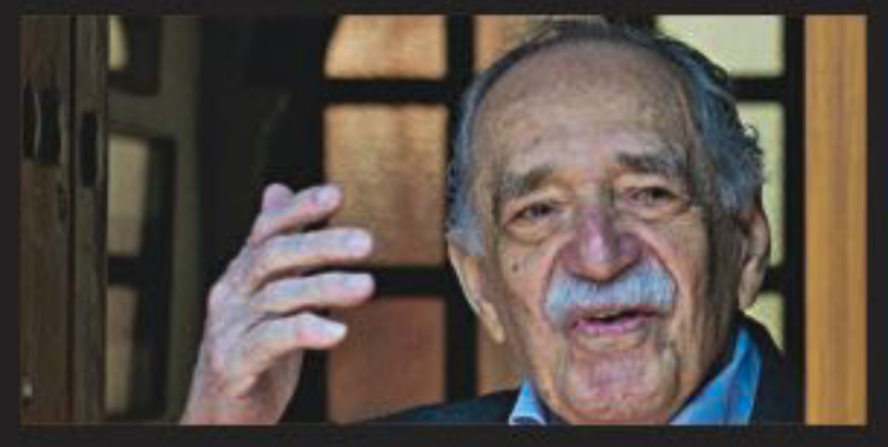
APR 17 - Gabriel García Márquez, Colombian novelist, short-story writer, screenwriter and journalist, dies of pneumonia at 87