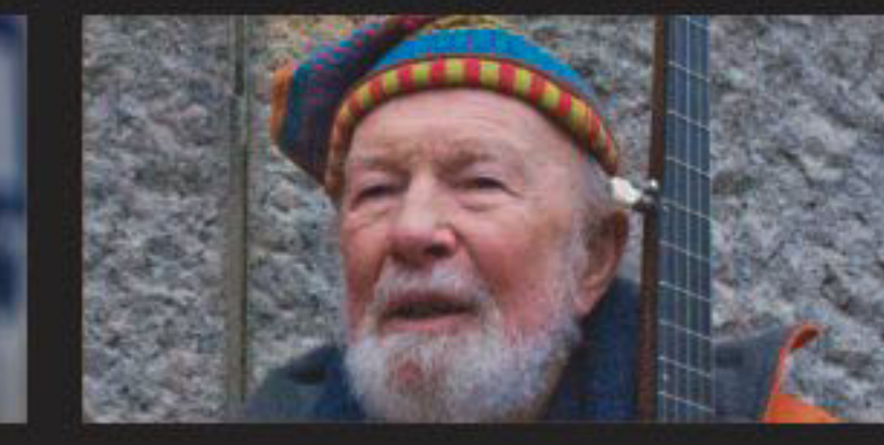
JAN 27 - Pete Seeger, American folk singer and activist, helped create the modern American folk music movement, dies at 94