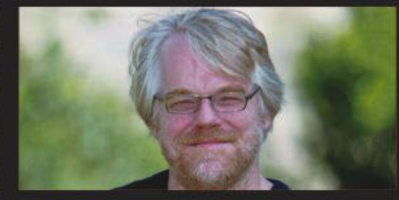
FEB 2 - Philip Seymour Hoffman, American actor (Capote, Moneyball) dies at 46 of a suspected drug overdose