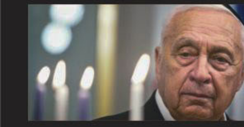
JAN 11 - Ariel Sharon, Israeli politician and general, dies from heart failure at 85