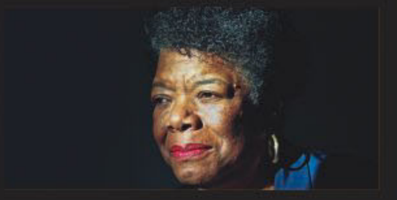
MAY 28 - Maya Angelou (Marguerite Johnson), American author, poet and actress (Nyo-Roots), dies at 86