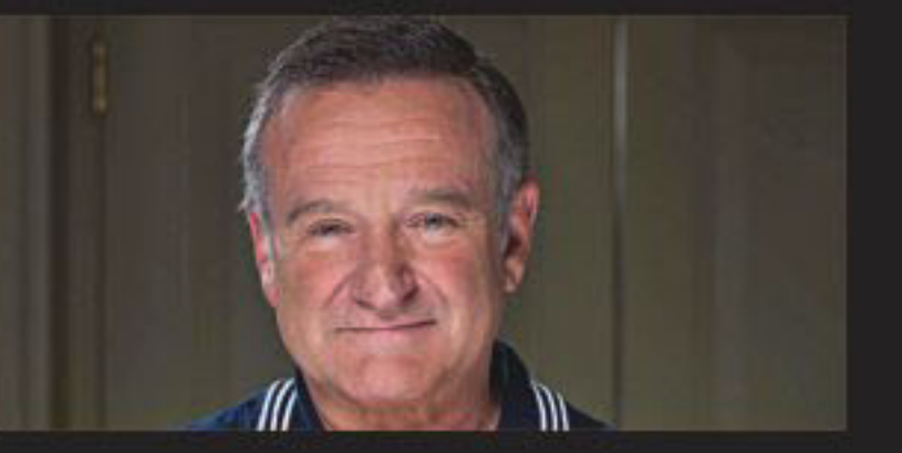
AUG 11 - Robin Williams, American actor and comedian, commits suspected suicide at 63