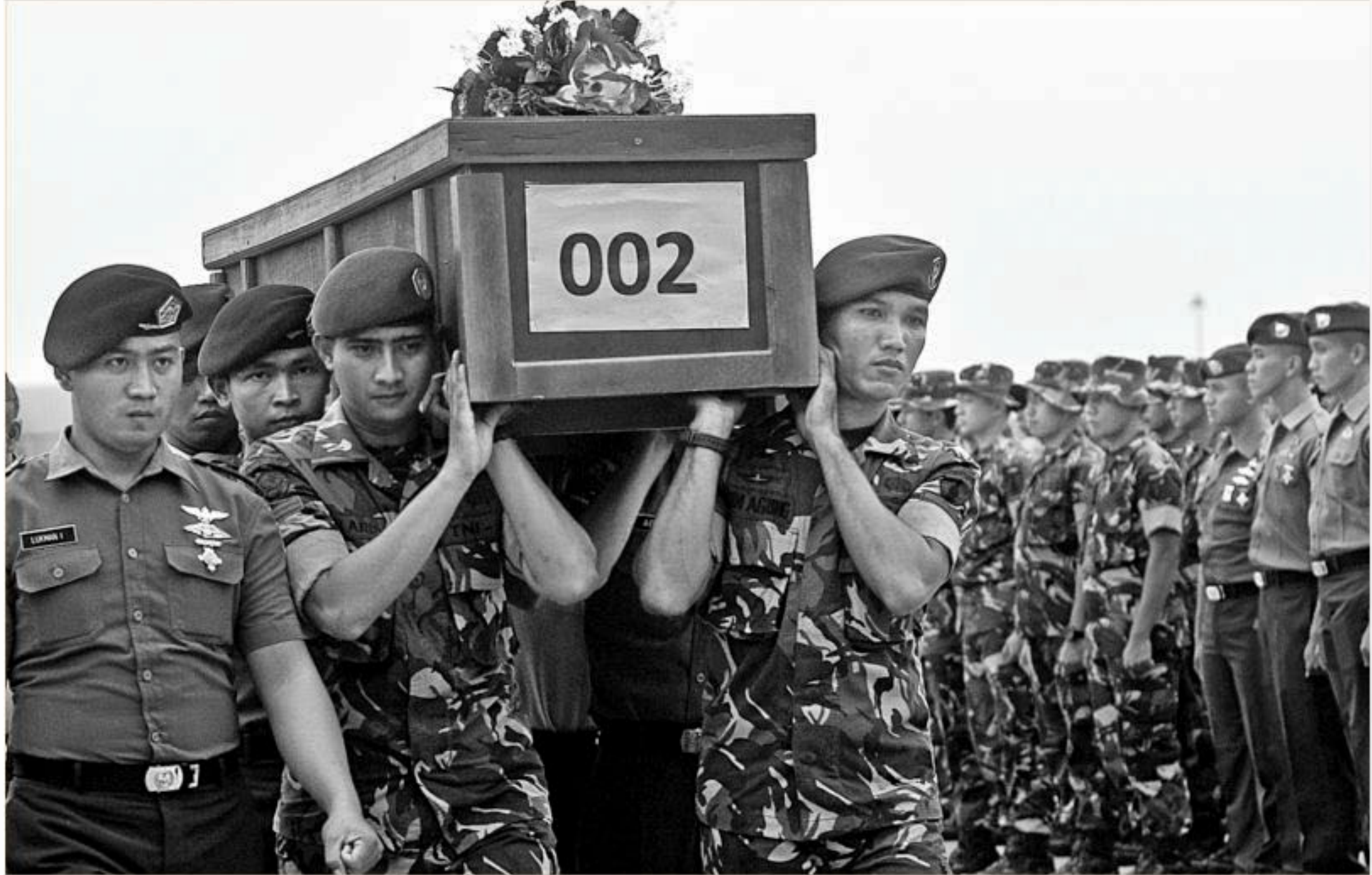
Indonesian military personnel carry coffins of victims recovered from the ill-fated Malaysian air carrier AirAsia flight QZ8501, upon their arrival at the military airbase in Surabaya, East Java, yesterday. Bad weather hampered efforts to recover scores of bodies from the crash site of AirAsia Flight QZ8501, as distraught relatives waited for news and gave their DNA to help identify loved ones.