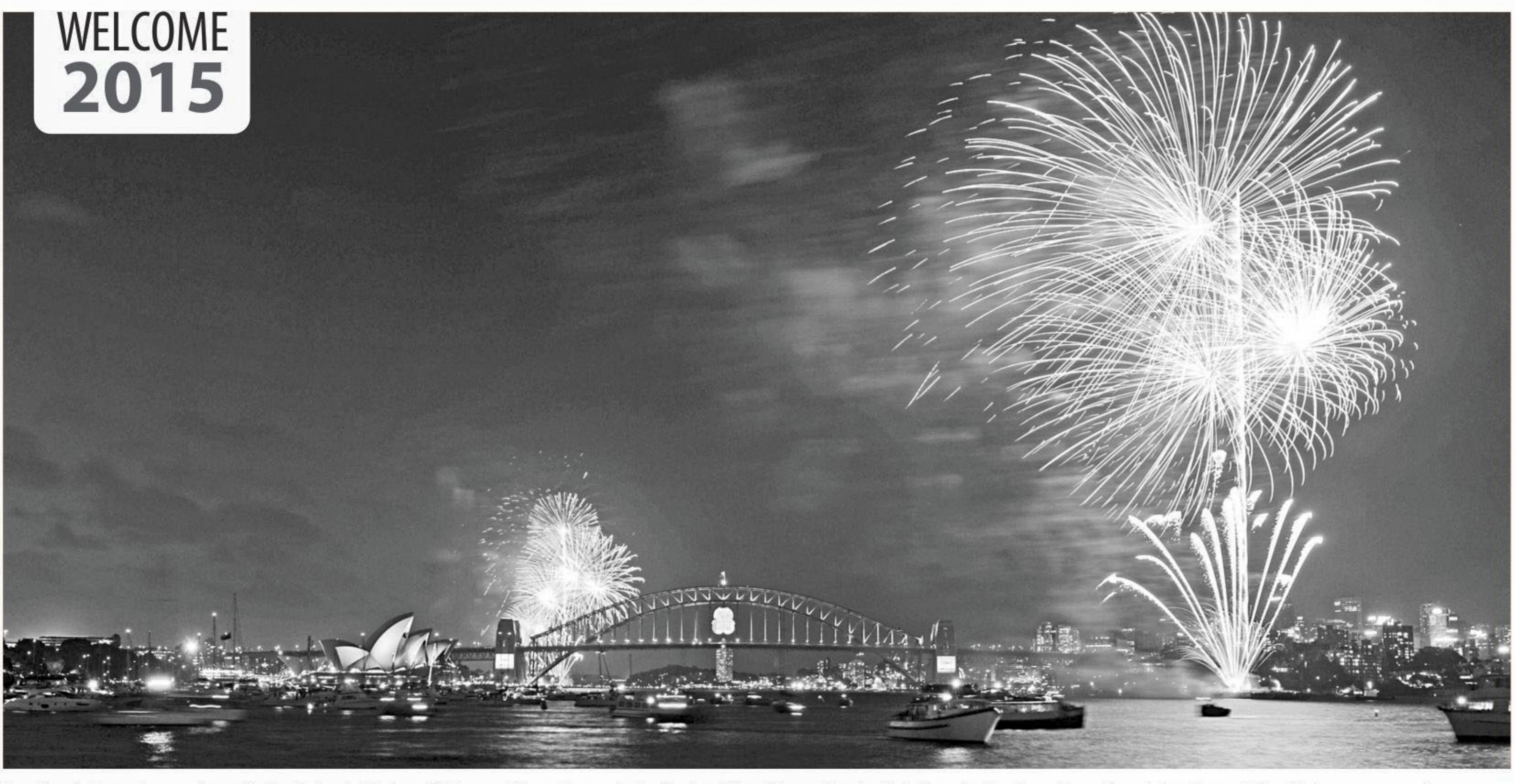
New Year's fireworks erupt over Sydney's iconic Harbour Bridge and Opera House during the traditional fireworks at midnight yesterday. From Hong Kong to London and New York to Rio, millions around the world will celebrate when the clock ticks past midnight, ringing in 2015 with massive fireworks displays, concerts and light shows.

AFP, Tunis Anti-Islamist Beji Caïd Essebsi, 88, was sworn in as Tunisia's first freely elected president at a ceremony in parliament yesterday. Essebsi's victory over outgoing moderate Islamist president Moncef Marzouki capped Tunisia's sometimes troubled transition to democracy and has won praise from Western leaders.