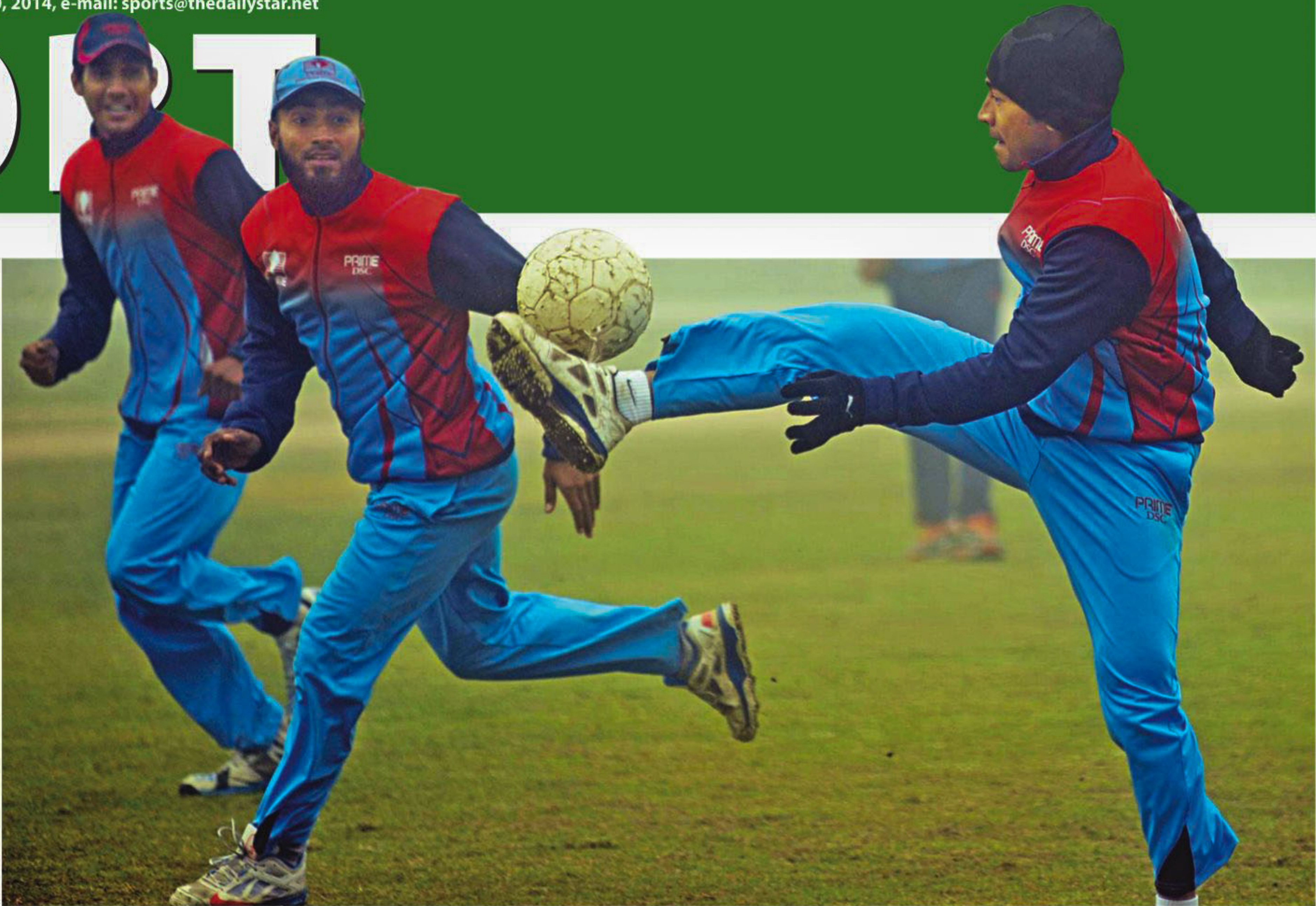
LIMBERING IN THE COLD FOR A SUMMER ADVENTURE: Bangladesh Test captain Mushfiqur Rahim (R) enjoys a game of soccer in biting cold at Mirpur ahead of an imminent Premier Cricket League game and more importantly for next February's World Cup Down Under.