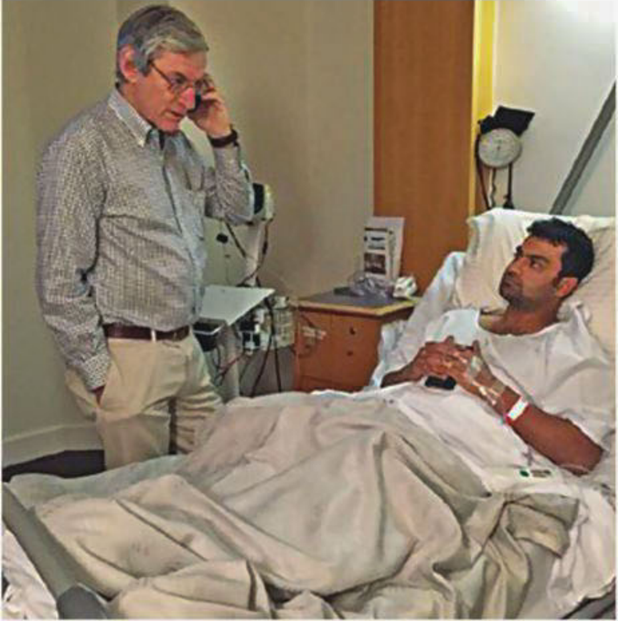
Tamim Iqbal awaits instructions from the doctor after undergoing a surgery on his knee in Australia yesterday. He is expected return to the field in two week's time.

Tamim left for Australia last Friday with a grade one meniscus tear on his left knee.