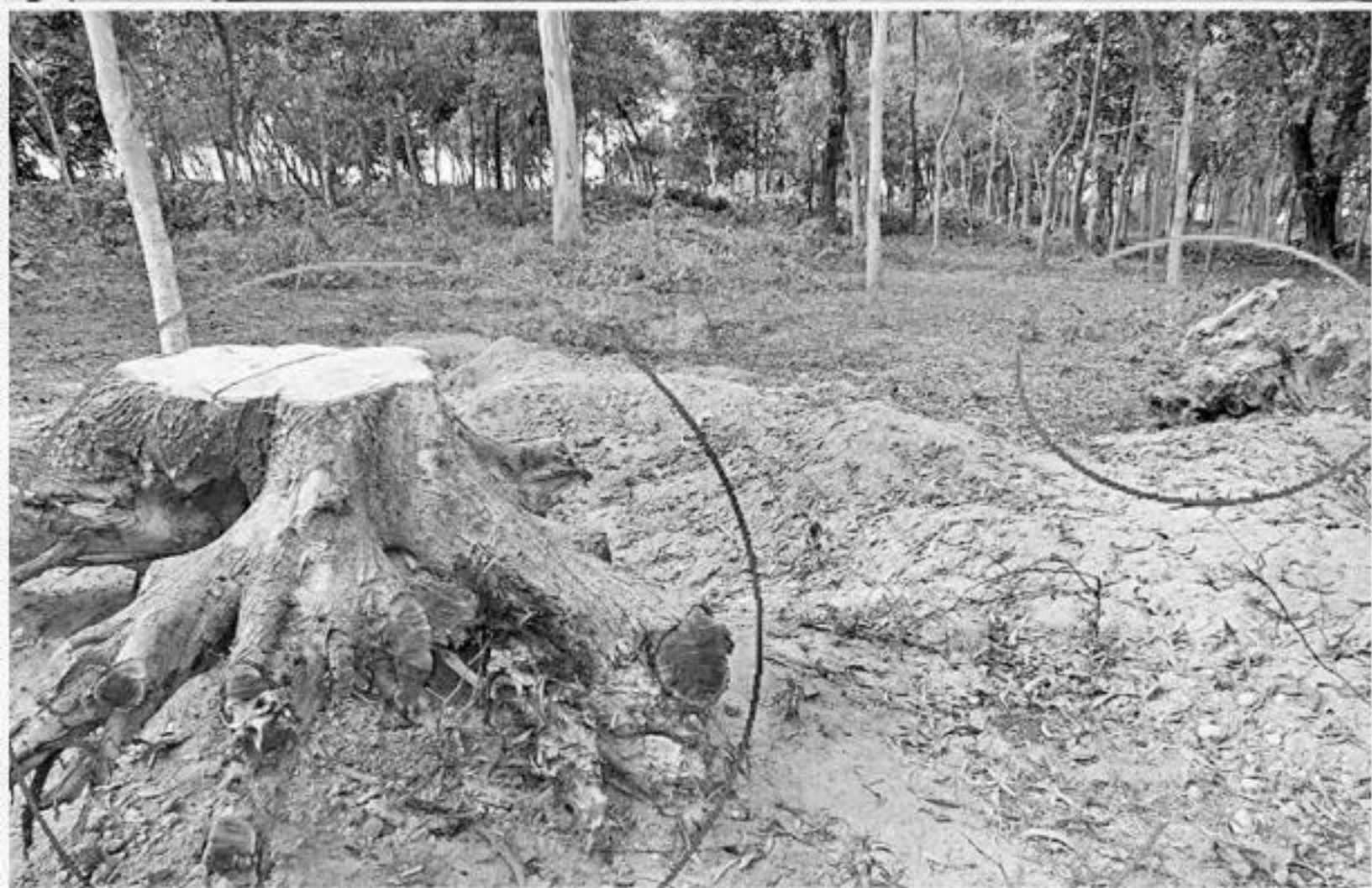
Illegal felling of trees from the forest near the Teesta barrage in Nilphamari has made the important structure vulnerable to erosion. Inset: Remains of the trunks of two stolen trees.