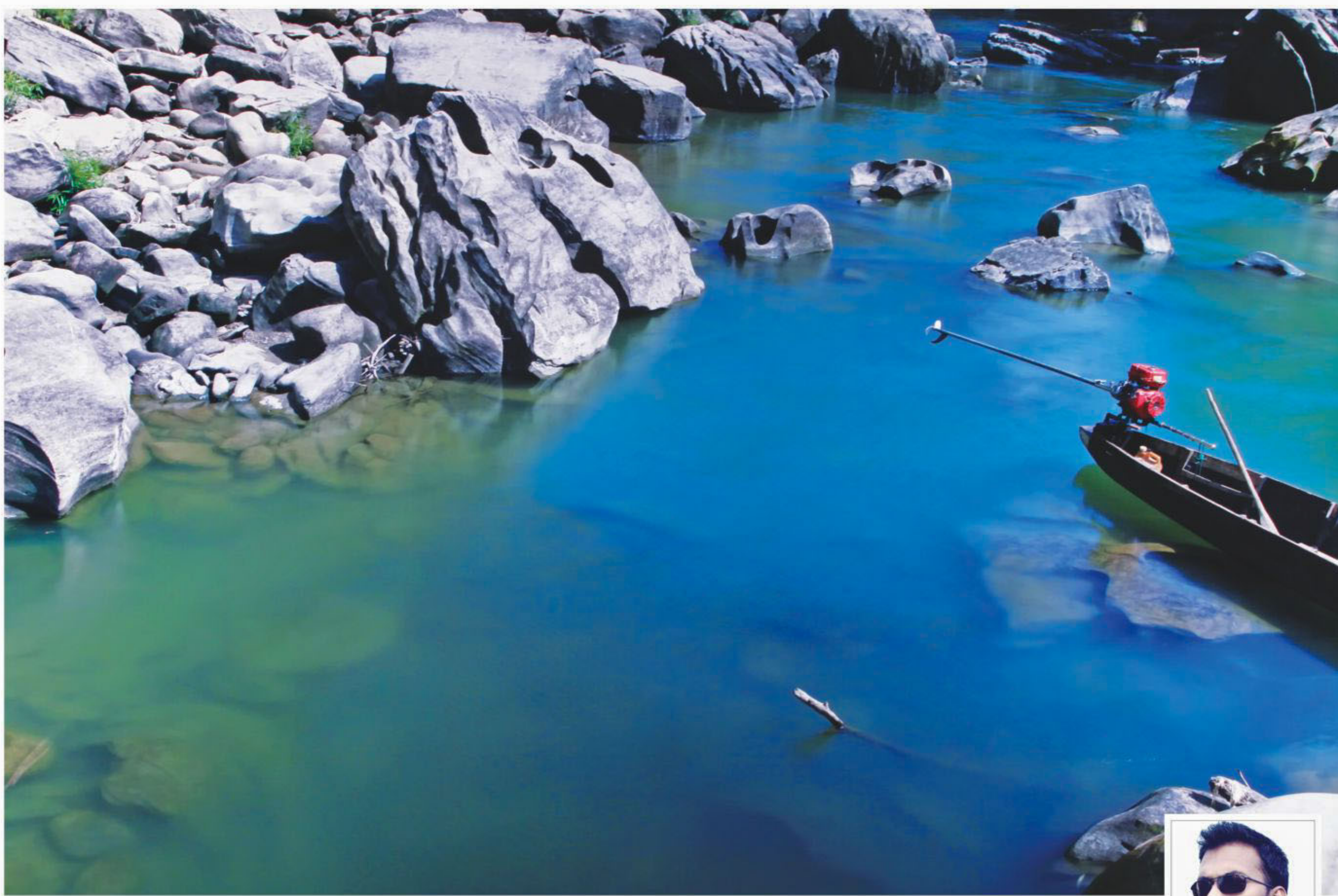
Sangu River in Bandarban with its spectacular charm, and also boulders like the ones on the surface which often cover shallow beds of it as well, posing a threat to unsuspecting rafters' boats. The photo was taken in 2013 by a finalist in the "Rivers of Bangladesh" category of The Daily Star's "inPixel" photo contest.

However, Jamal got three years' jail time as the charges were pressed before November 20.