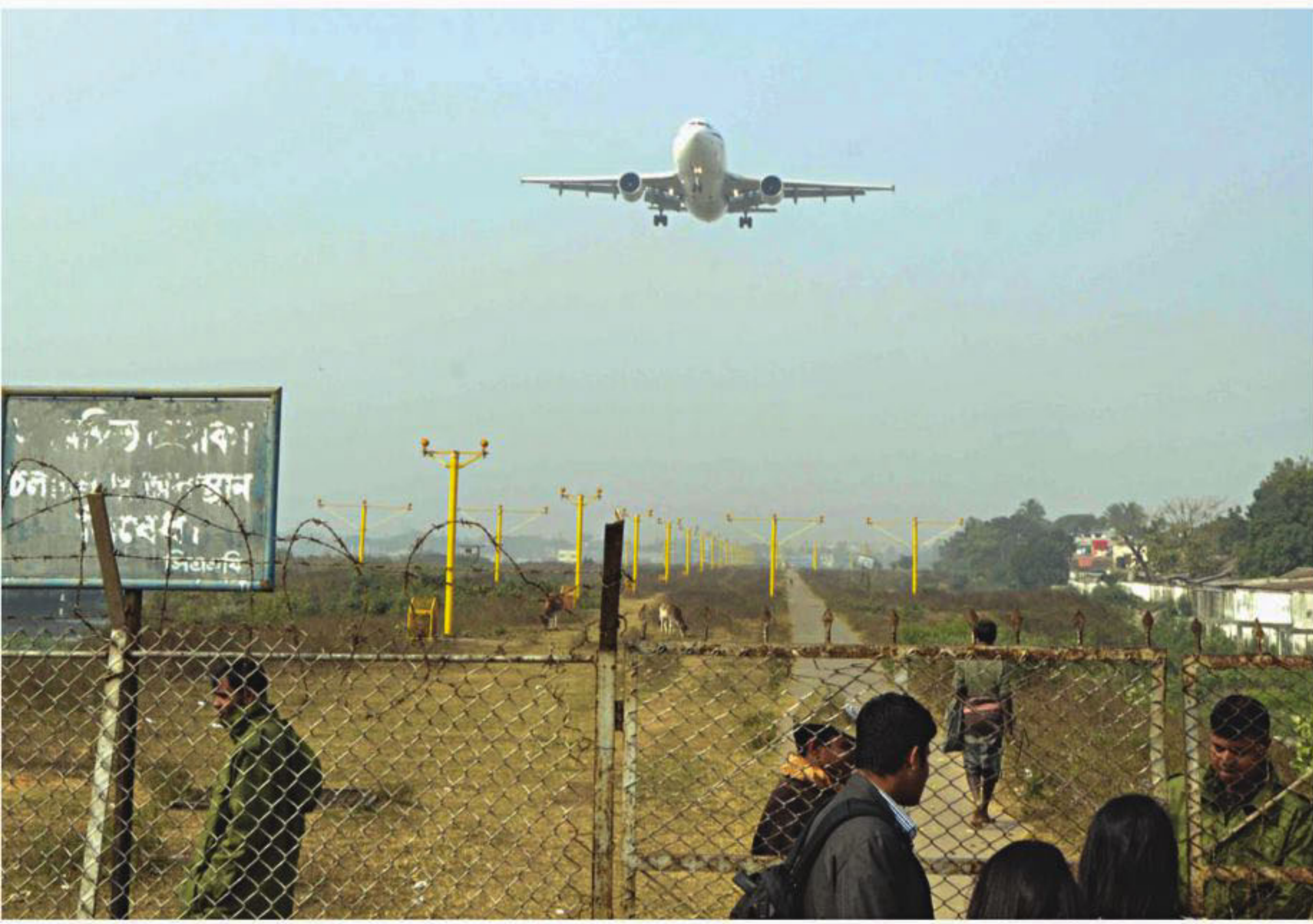
People enter the airport through the back gate next to the runway of Hazrat Shahjalal International Airport, a restricted area, allegedly by bribing ansars who guard the gate. The photo was taken yesterday.