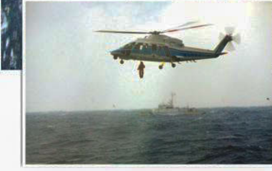
Japanese Coast Guard personnel fish crew members of Ming Guang out of the chilly waters between Honshu and Hokkaido islands on Friday. The crew members abandoned ship after it started listing and finally sank.