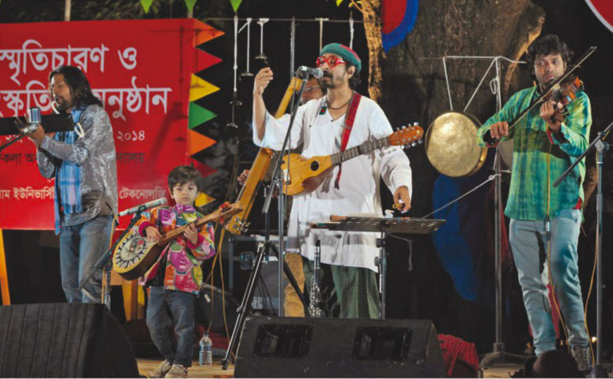
The band engages the audience.

The crowd enthusiastically sang along while