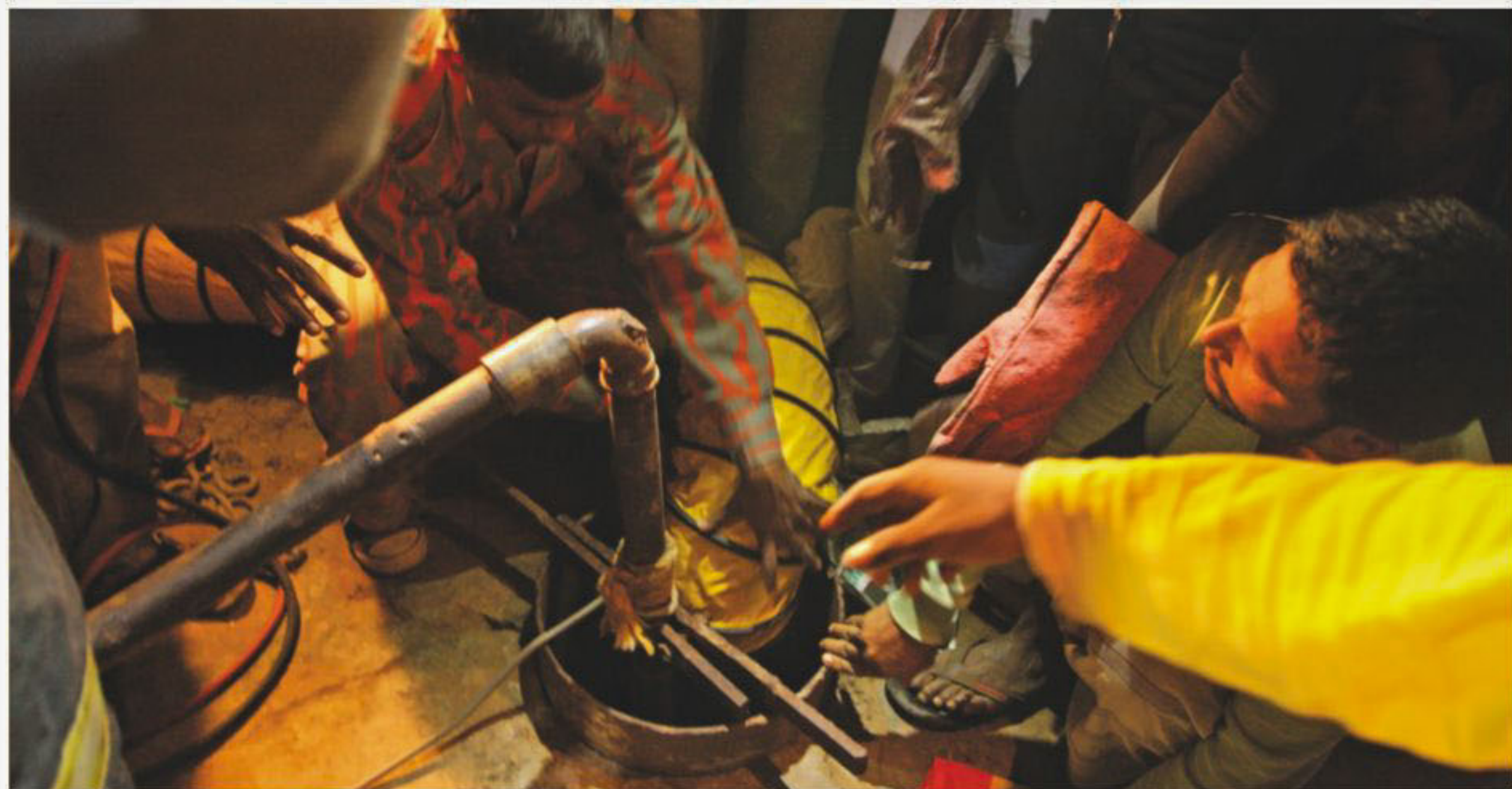
Rescuers pump in oxygen into a well shaft and try to recover what they thought was a child trapped in it. Tying a sack at the end of a rope, they lower it down at Shahjahanpur Railway Colony in the capital yesterday.

Camera reaches "the bottom", finds no sign of the boy