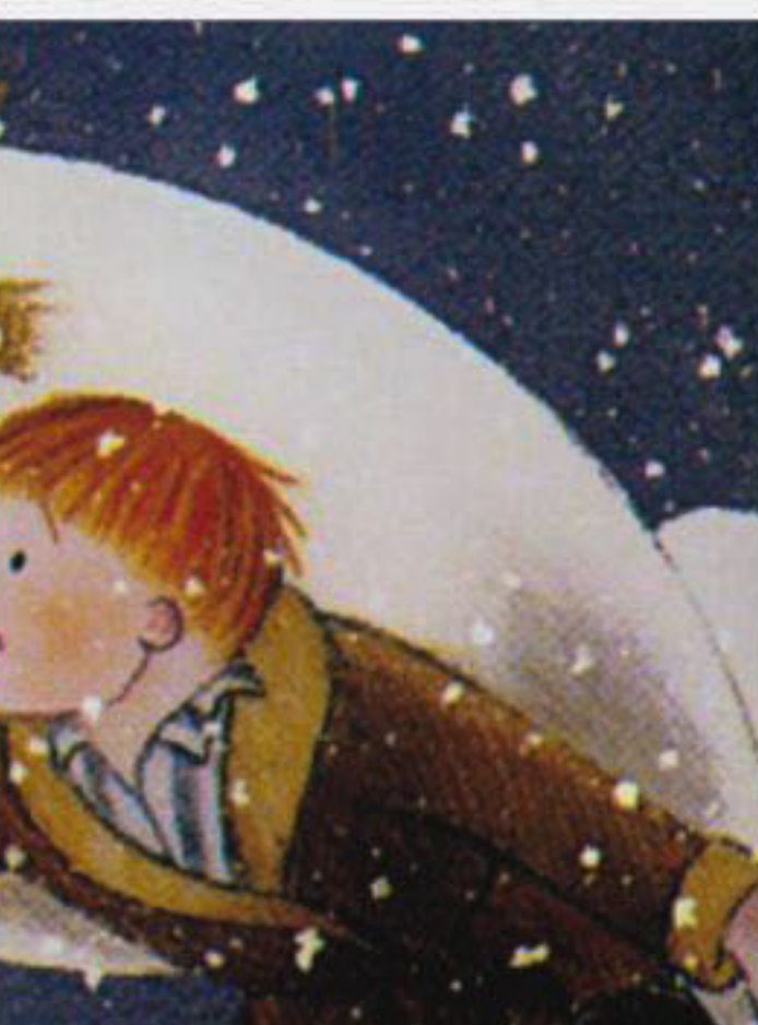
Meet Me in St Louis

idea of America than any other film. A panoramic slice of family life in the year leading up to the 1904 World's Fair in the Missouri city, "Meet Me In St Louis" also presents what may be the original 'blue Christmas': distraught that she will spend her last one ever in her family