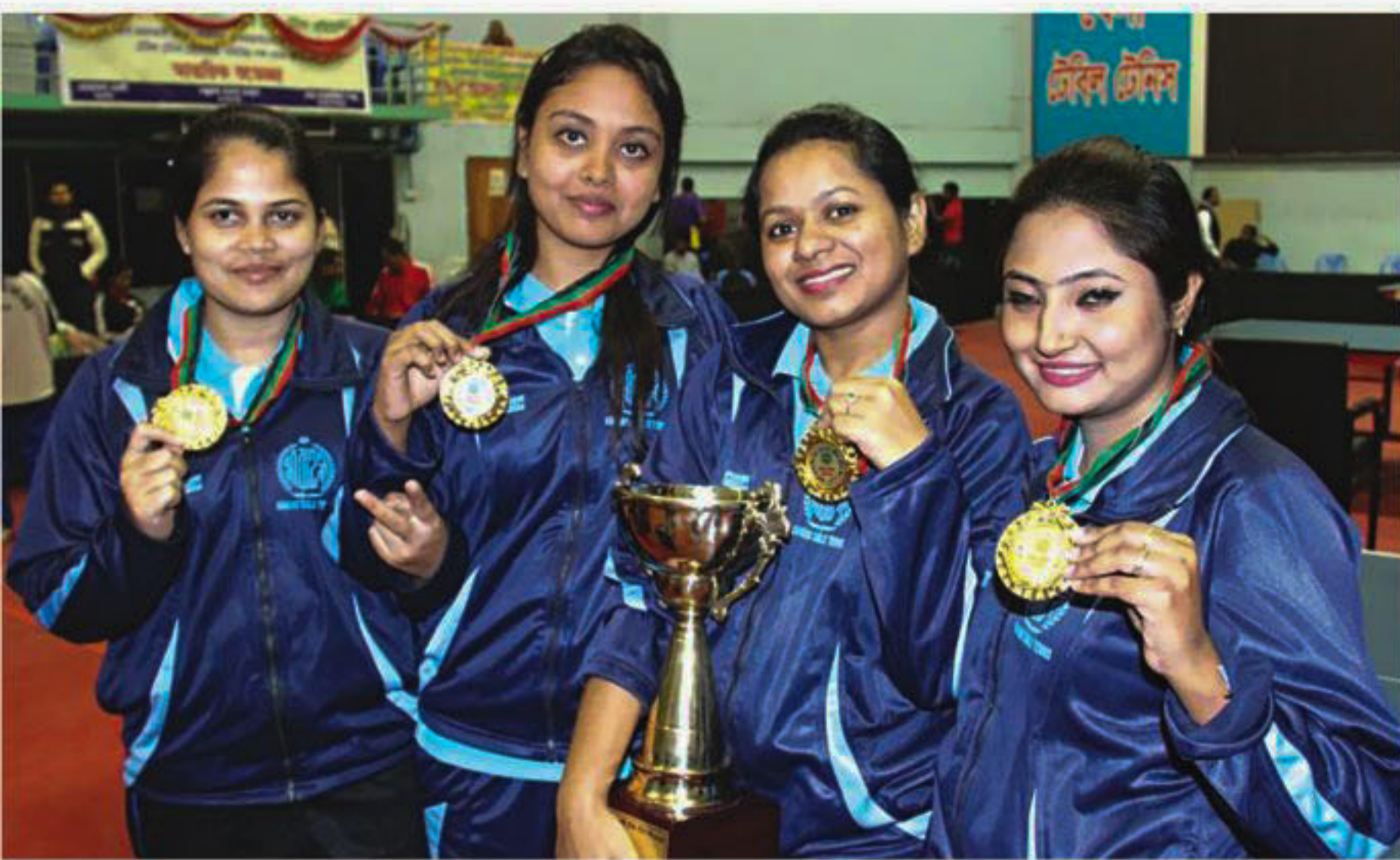
The Abahani team members pose for photographs after winning the Agrani Bank Dhaka Metropolis Women's Table Tennis League at the Wooden Floor Gymnasium in Paltan yesterday.

Hafeez was suspended from bowling in international cricket last month by the ICC after failing a bowling test soon after he was reported for his action by match officials after the first Test against New Zealand.