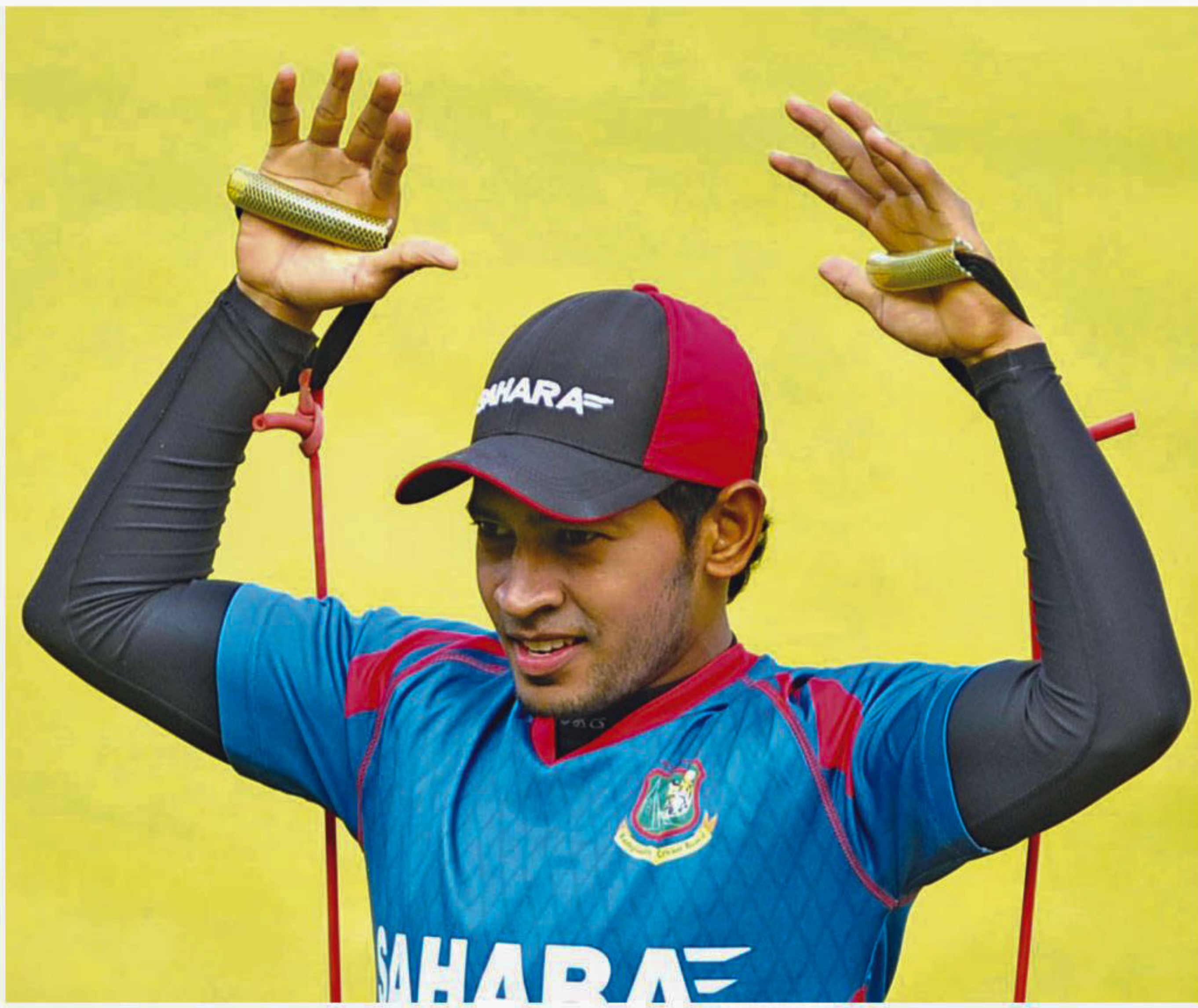
Mushfiqur Rahim remains hopeful that Tamim Iqbal will come back from his injury before the World Cup.

CMG interested in buying sponsorship and marketing