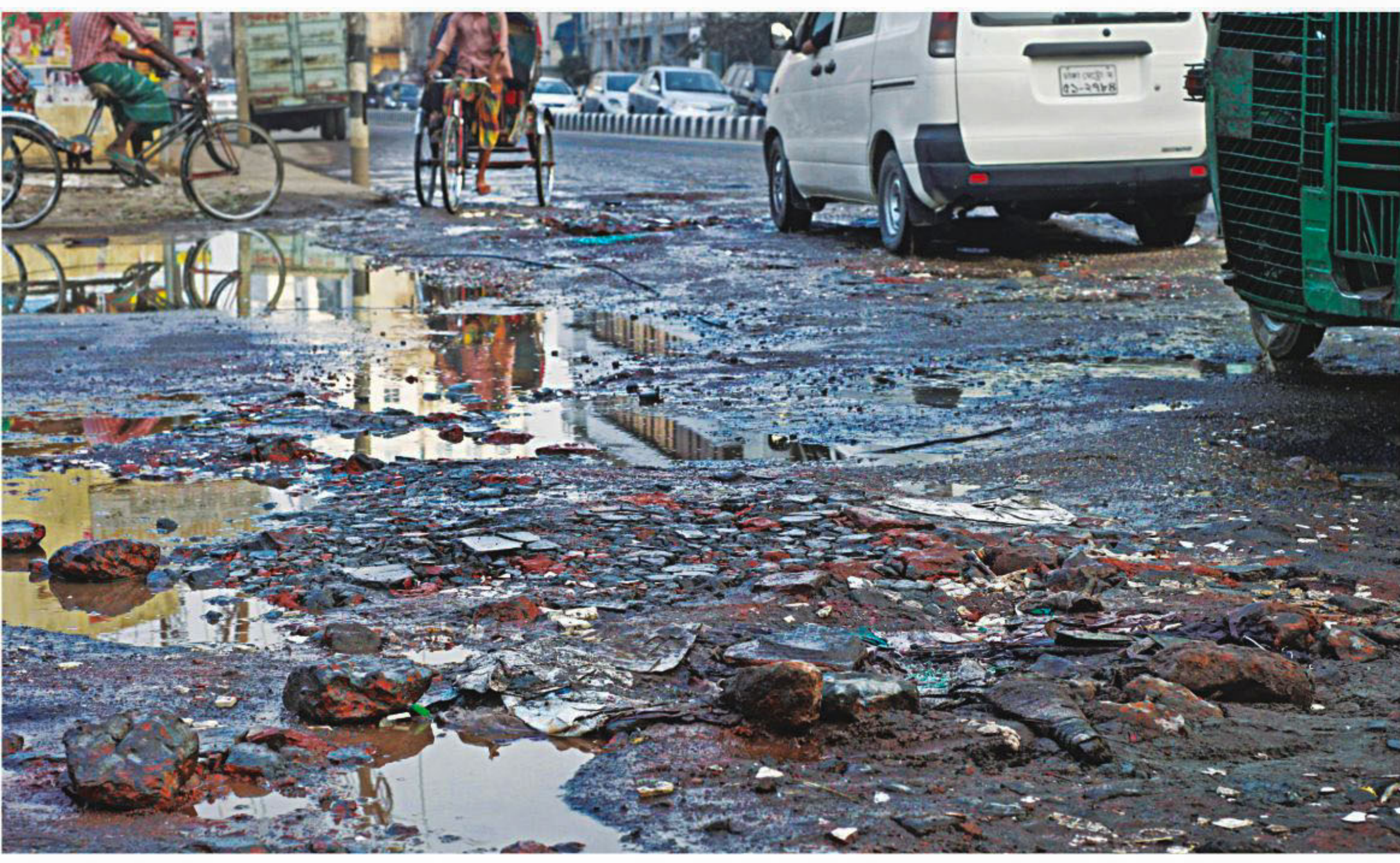
Sewage from an overflowing manhole and water from a cracked main created puddles on the Tejgaon-Gulshan Link Road damaging the surface of the road. Locals tried to fix the problem by dumping rubble. The authorities seem to have not noticed this.

Asad Mia, project implementation officer (PIO) of the Sadar upazila, said he had visited the spot and assured this correspondent that the district administration would distribute warm clothes, dry food and necessary materials to build houses in the affected neighbourhoods today.