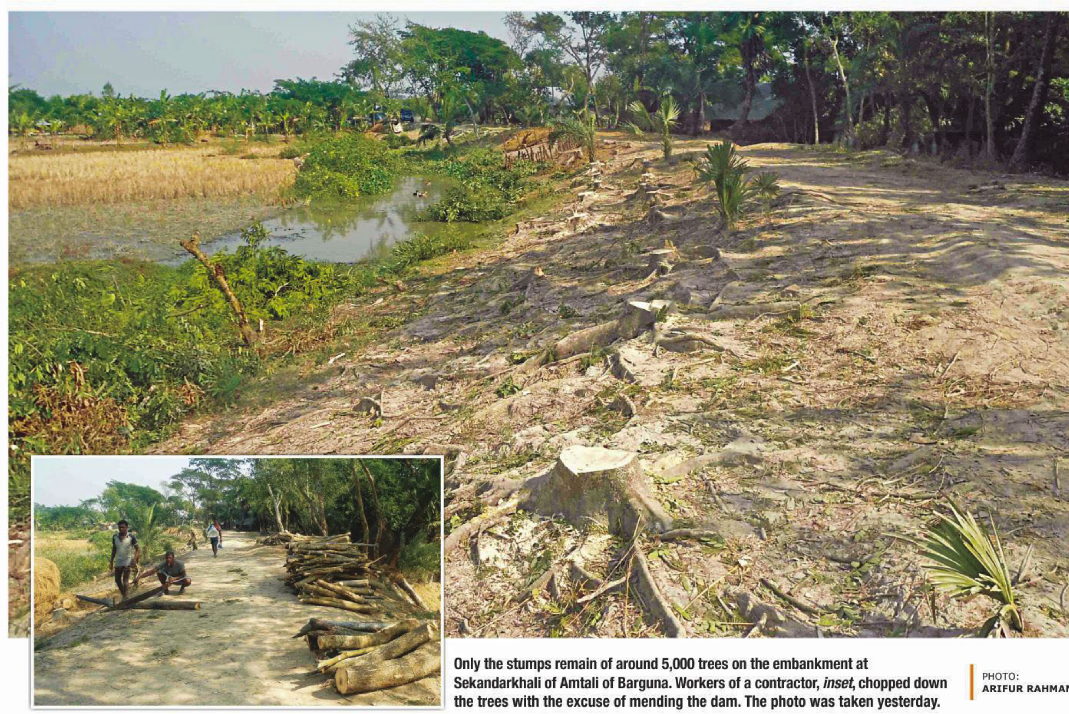
Only the stumps remain of around 5,000 trees on the embankment at Sekandarkhali of Amtali of Barguna. Workers of a contractor, inset, chopped down the trees with the excuse of mending the dam. The photo was taken yesterday.

Imran Hossain was stabbed to death by a group of criminals in