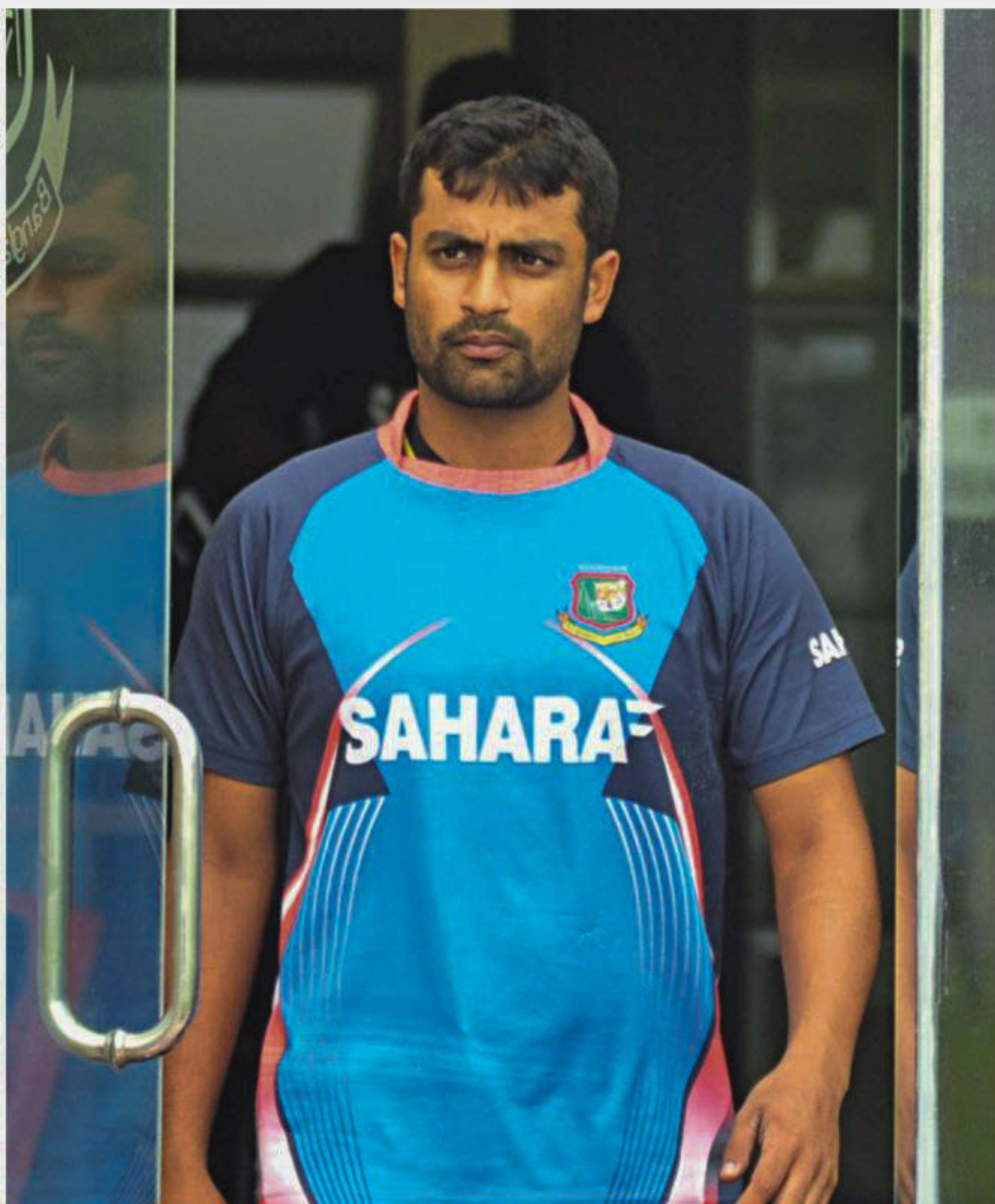
A test report yesterday has revealed a meniscus tear in Tamim Iqbal's left knee. The injury may require a surgery which can keep the opener out of the game for around one and half month.

Bangladesh also has very important home assignments right after the World Cup.