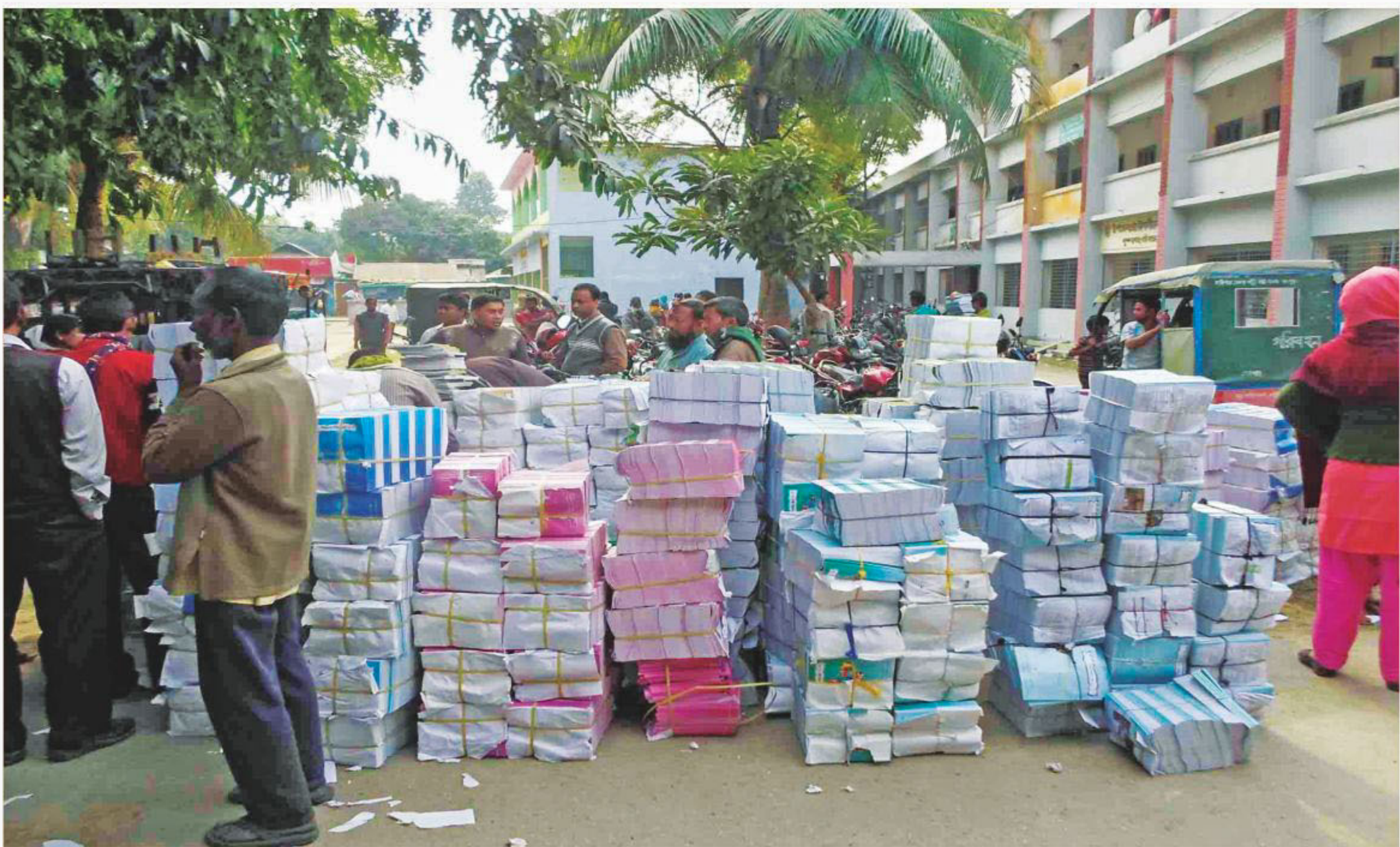
Stacks of textbooks on the premises of Sundarganj Upazila Parishad in Gaibandha waiting to be dispatched to schools yesterday. With just days to go before the students are supposed to get the new books on New Year's Day, the authorities are in a hurry. The education ministry has been celebrating the day as "Textbook Festival Day" for the last few years.