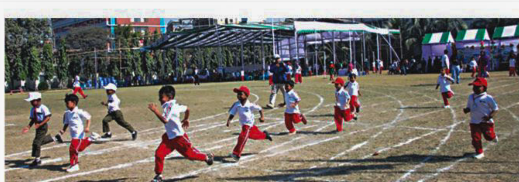
Tiny tots compete in a race during an inter-school sports competition organised by Cardiff International School at the Physical College ground in Mohammadpur yesterday.

AUSTRALIA: Second innings 130 (Rogers 55, Smith 28; I Sharma 3-38, Yadav 2-46) Result: Australia won by 4 wickets. Player-of-the-match: Steve Smith.