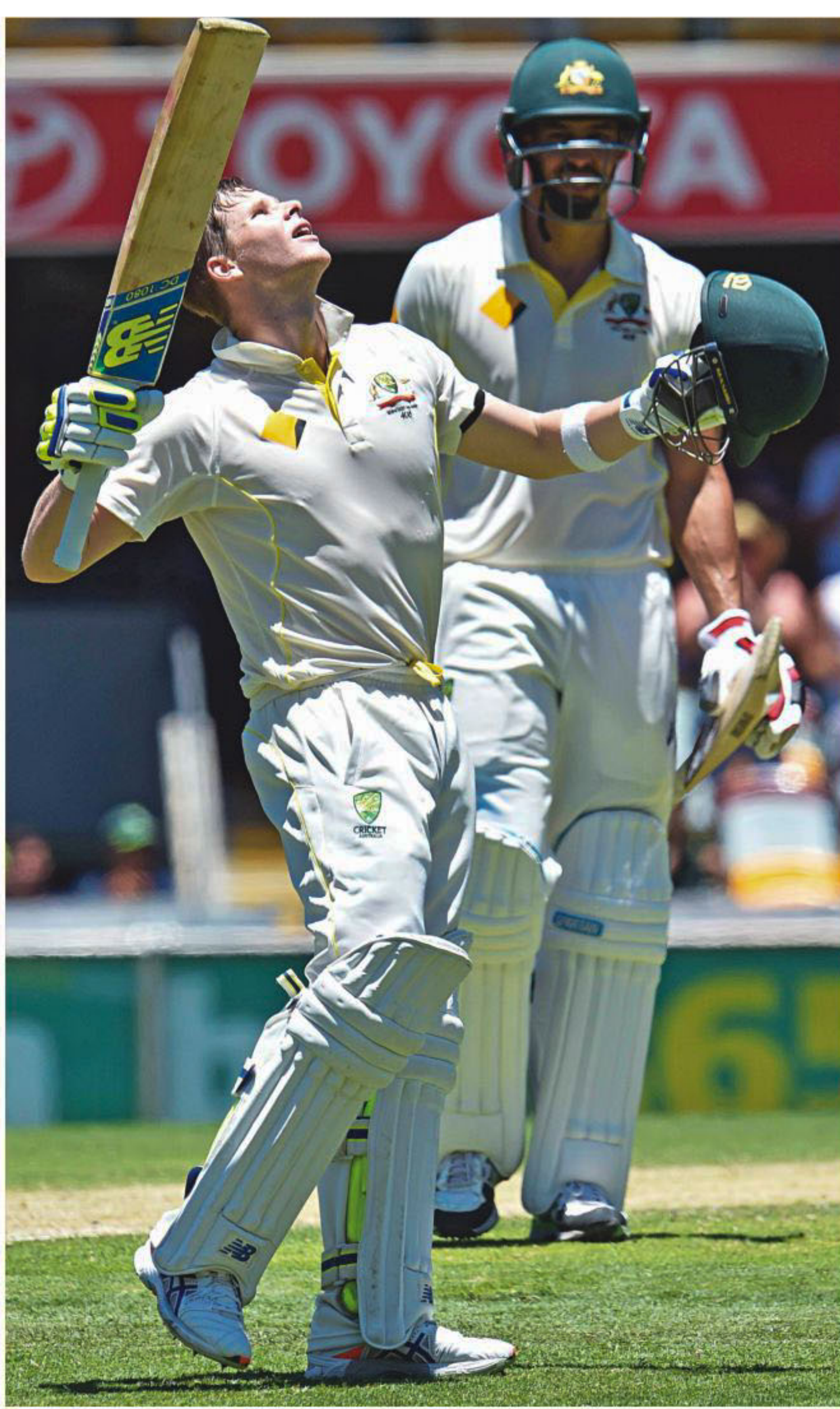
Australia batsman Steve Smith (L) celebrates his first Test century as captain with partner Mitchell Johnson on the third day of the 2nd Test against India at the Gabba in Brisbane yesterday.

The Bangladesh Olympic Association submitted Tk 10 crore to host the Indo-Bangladesh Games, Youth and Child Games and to participate in 12th SA Games.