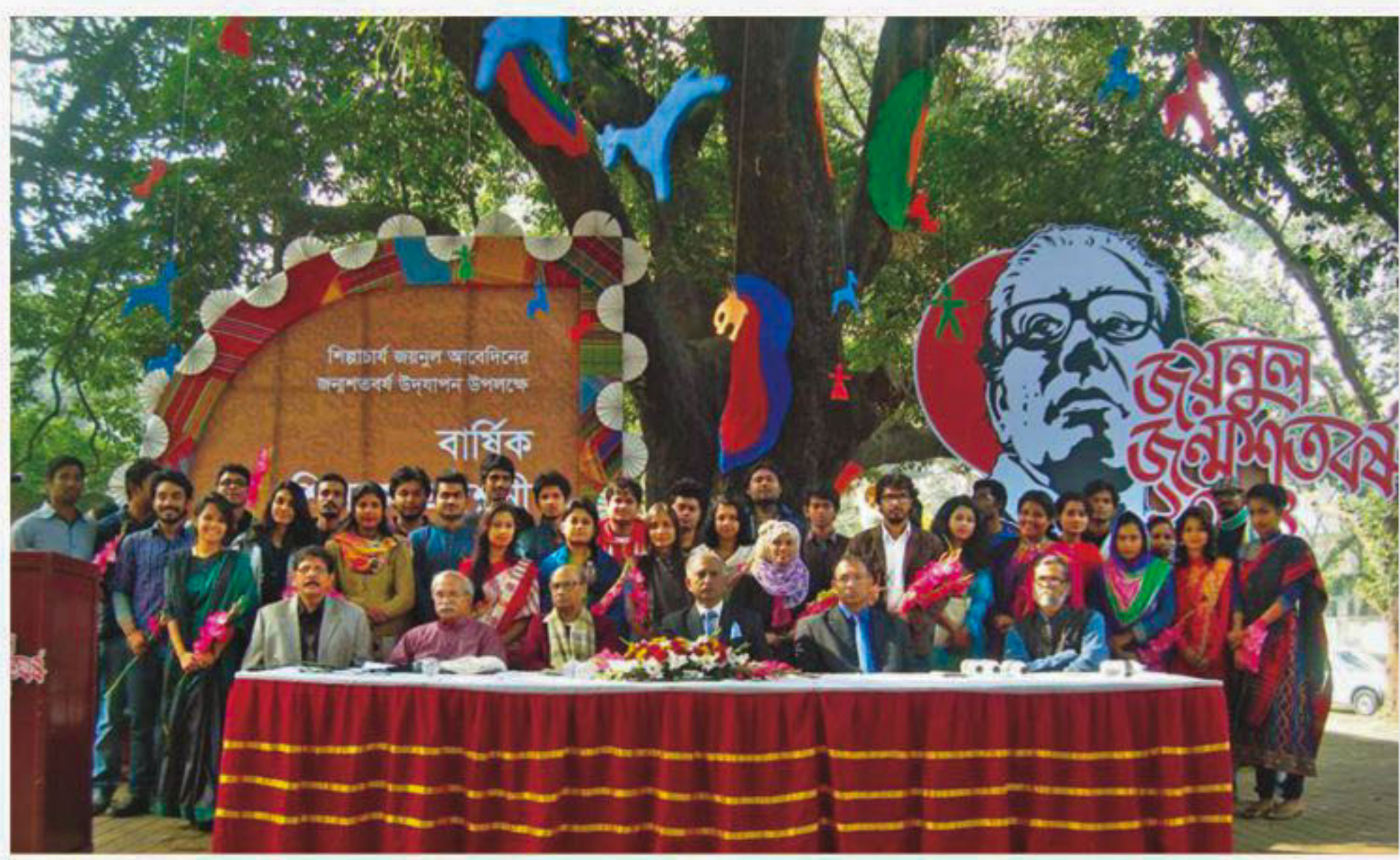
Guests and artists at the opening of the exhibition.

ZAHANGIR ALOM Faculty of Fine Arts (FFA) of University of Dhaka has worn a festive look marking Birth Centenary of Shilpacharya Zainul Abedin (December 29, 1914 – May 28, 1976), the pioneer of fine art and art education in Bangladesh. In celebration of the occasion, a three-week (December 11-31) Annual Art Exhibition has got many new dimensions and surprises. The exhibition, dedicating to the recently deceased eminent artist Qayyum Chowdhury, is a unique experience for the art audience, as they can view all the processes of art creations and productions by the seven departments. The departments are showcasing art pieces by the students while Zainul Gallery -1 and 2 are displaying artworks by the teachers. A big installation is