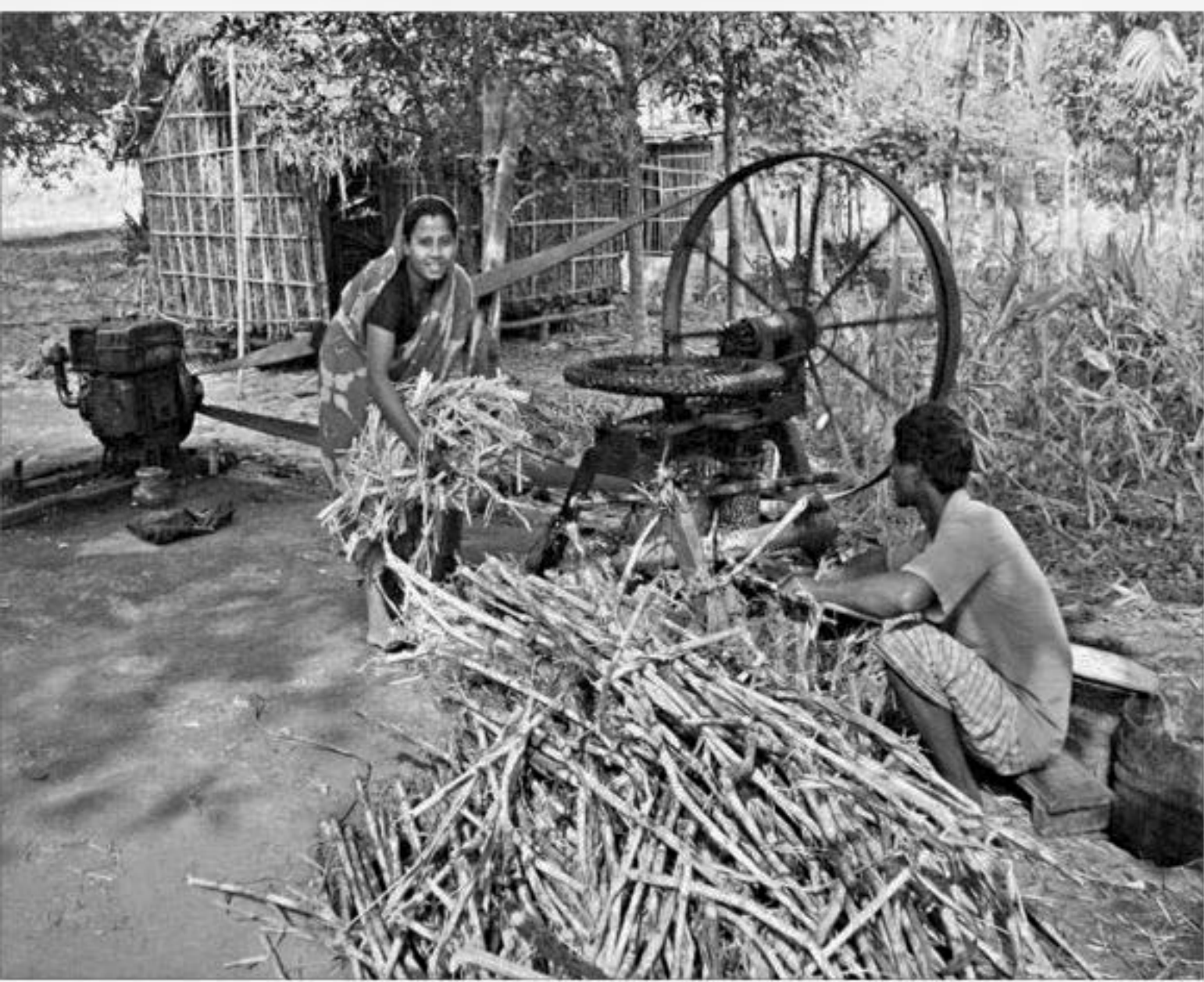
Crushing sugarcane to make molasses is now a common sight in different areas of Thakurgaon district as many farmers, despite agreement with sugar mills to supply the item, are selling it to molasses producers for more profit. The situation is likely to cause shortage of sugarcane in the new crushing season starting today.