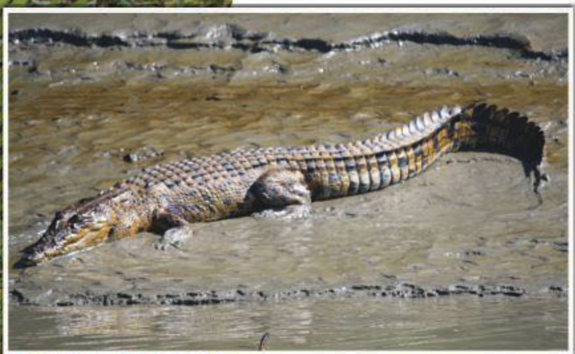
People boiling the furnace oil scooped up from the Shela river in the Sundarbans yesterday to get rid of the water in it. They intend to sell the oil. A crocodile, inset, on the bank of the Shela river that has a layer of oil.