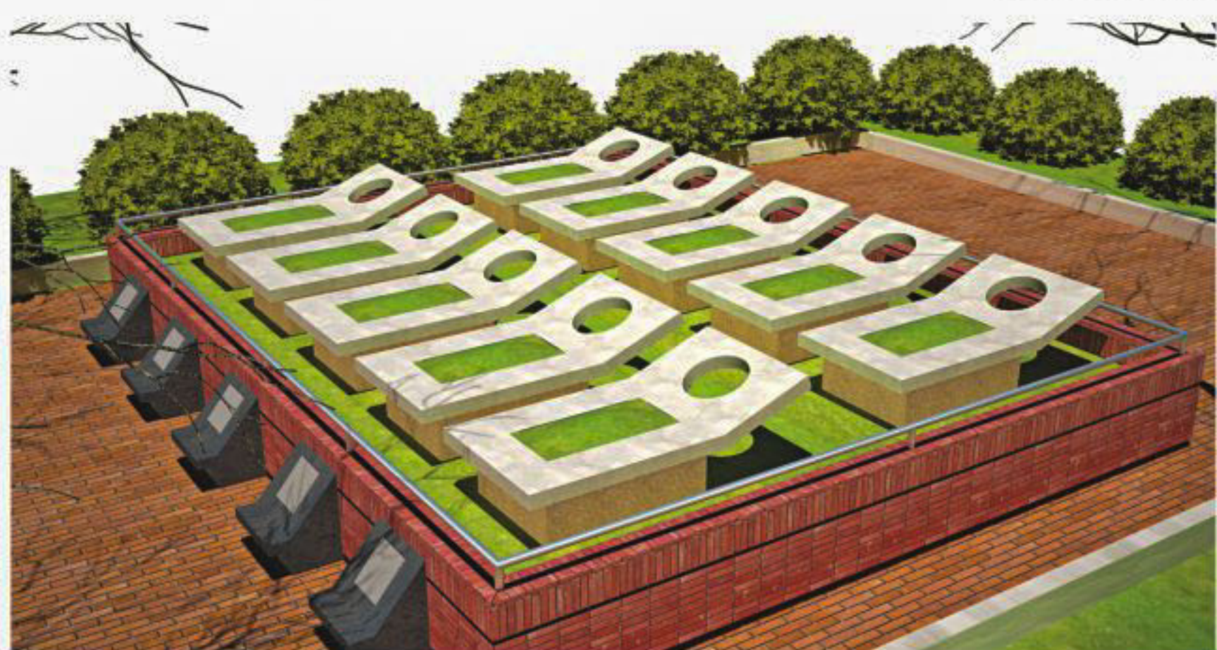
The approved design for freedom fighters' graves.