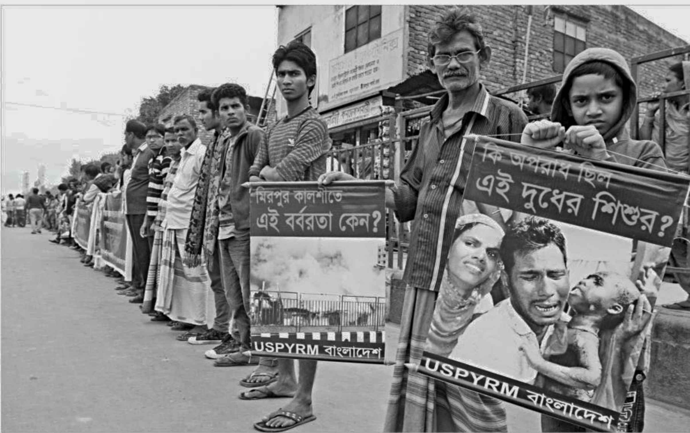
Some hundred Biharis form a human chain at Kurmitola in the capital yesterday demanding arrest and exemplary punishment for the perpetrators of the June 14 gruesome incident in the area that killed 10 Biharis including nine of a family. The Urdu Speaking Peoples Youth Rehabilitation Movement, a platform of Biharis, organised the event marking six months of the incident.