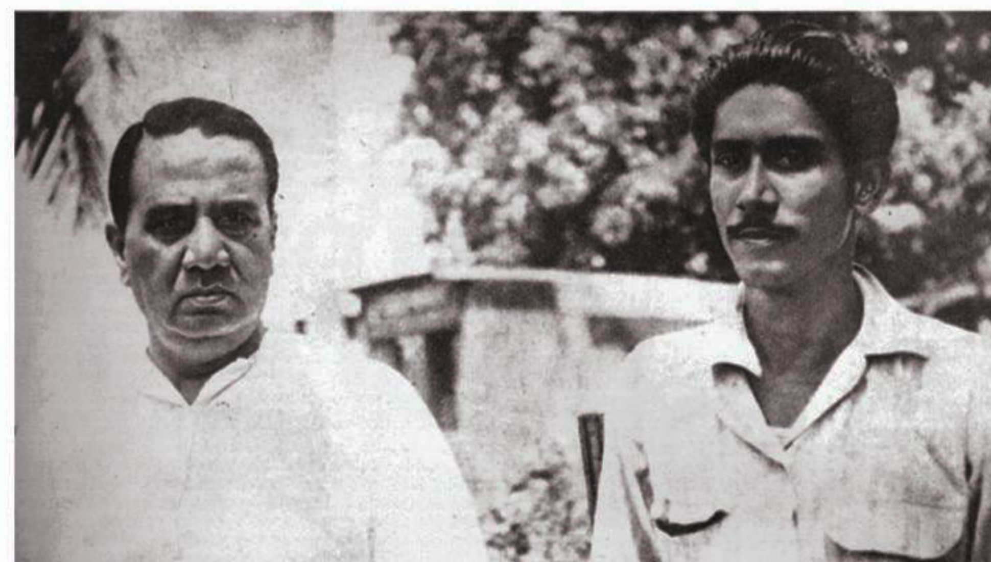
Huseyn Shahid Suhrawardi with Bangabandhu Sheikh Mujibur Rahman (R).