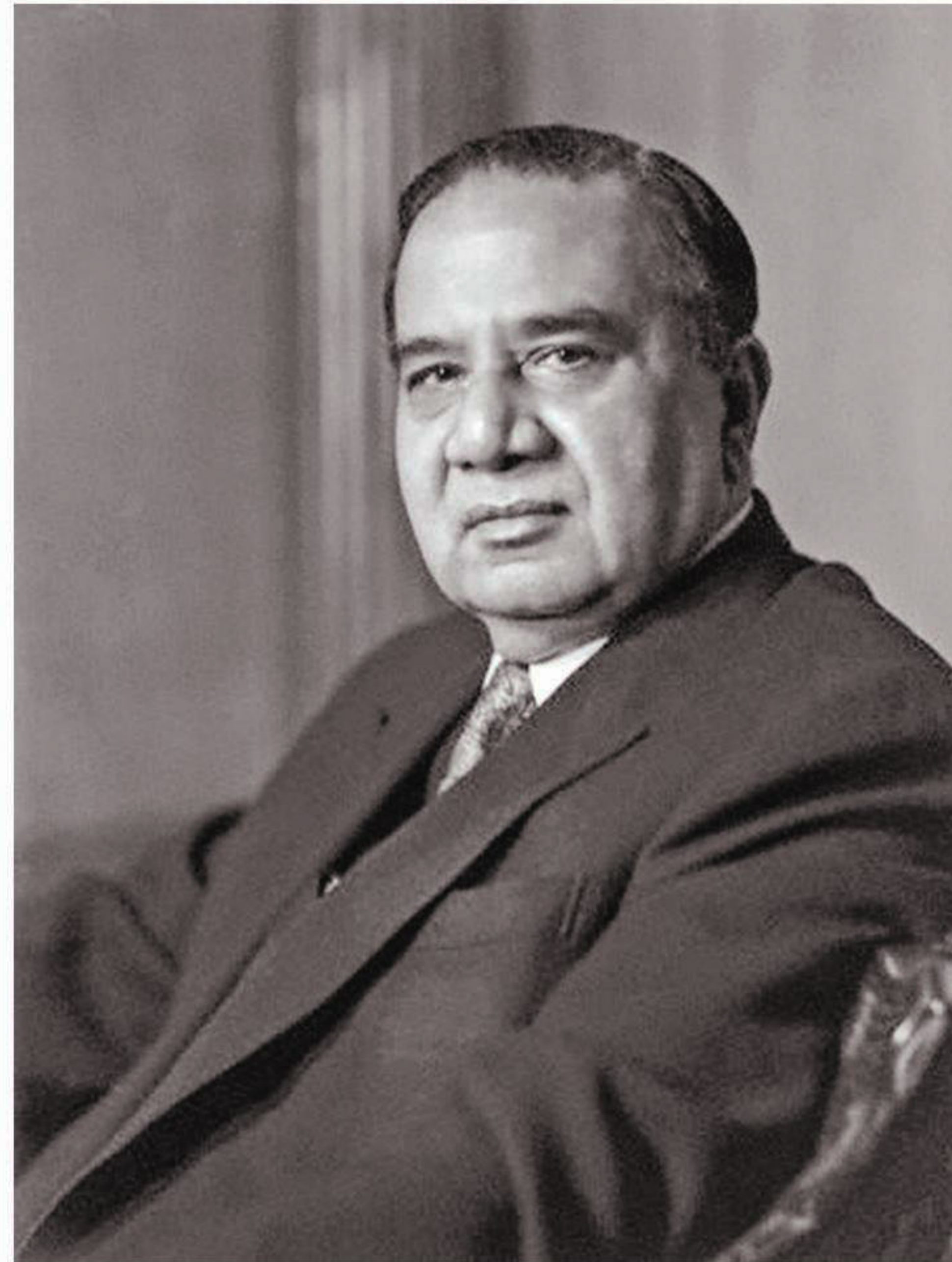
Huseyn Shahid Suhrawardi

Huseyn Shahid Suhrawardi was one of the most influential Bengali politicians in the first half of the 20th century. His immense political contribution shaped the birth of two nations: Pakistan and Bangladesh. He served as the Chief Minister of Bengal in British India and was elected as the fifth Prime Minister of Pakistan. His determined leadership and guidance inspired leaders like Bangabandhu Sheikh Mujibur Rahman to fight for the rights of our countrymen. We remember this great leader on his 51st death anniversary.