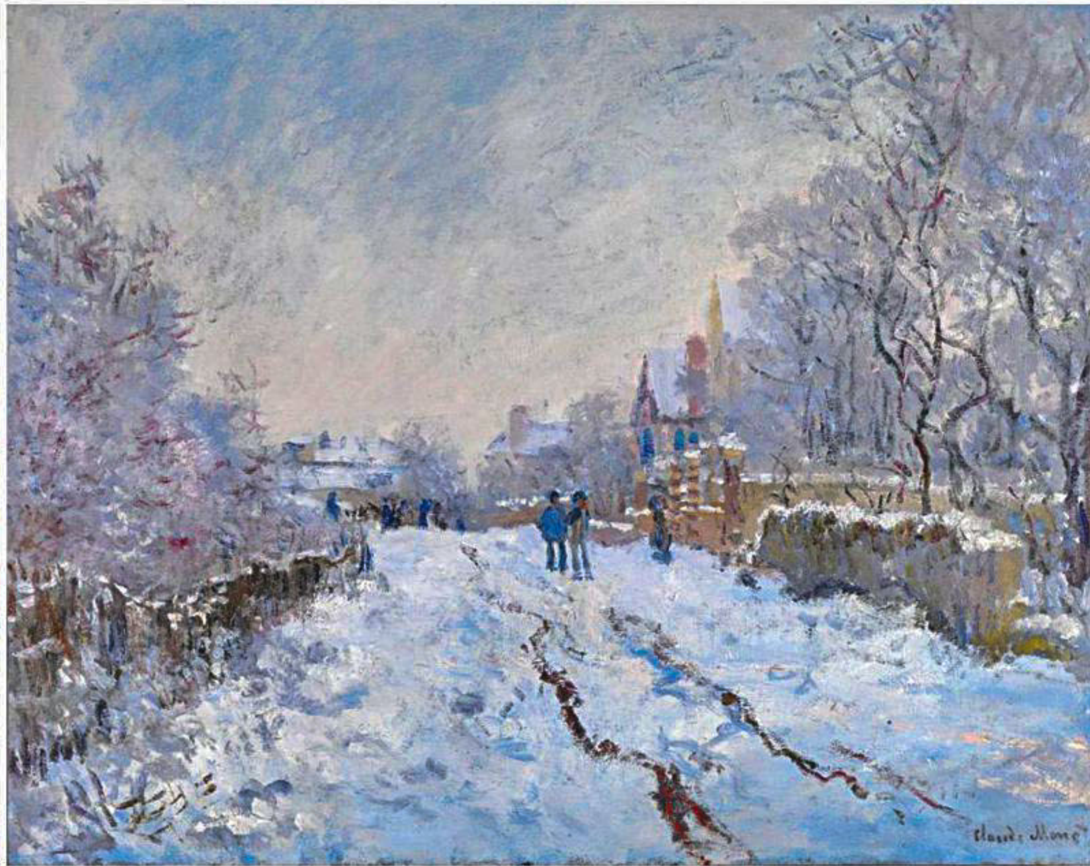
Claude Monet's Snow Scene at Argenteuil