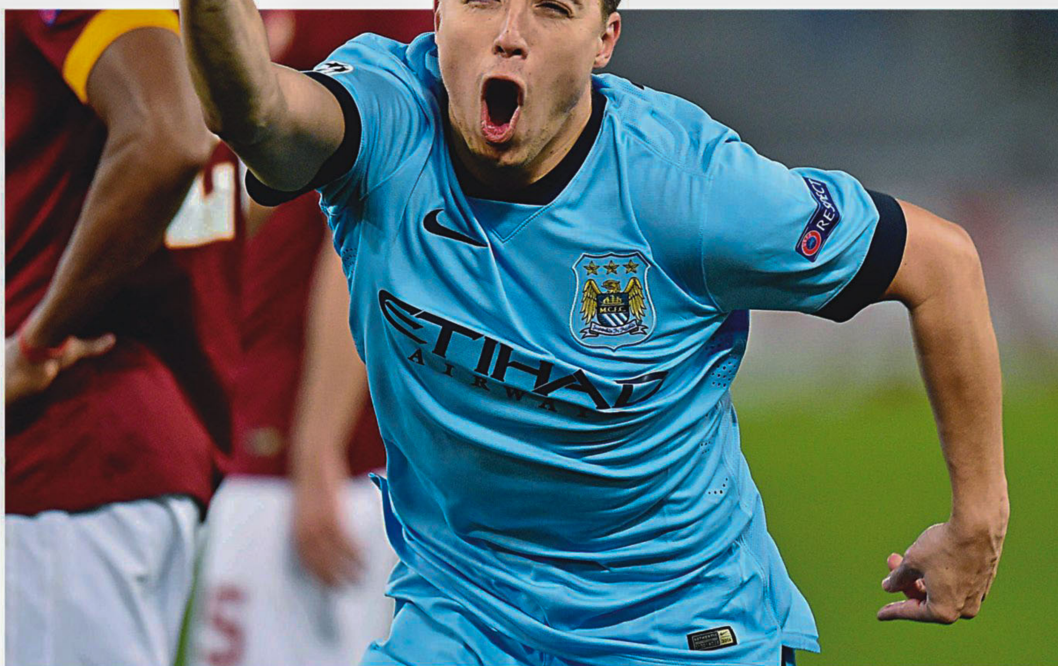
Manchester City midfielder Samir Nasri is ecstatic after scoring the opening goal against Roma during their Champions League encounter at the Olympic Stadium in Rome on Wednesday.

New Zealand staged a remarkable comeback to level the three-match Test series 1-1 after losing the first game and drawing the second and also had a come from behind parity in the two-match Twenty20 series.