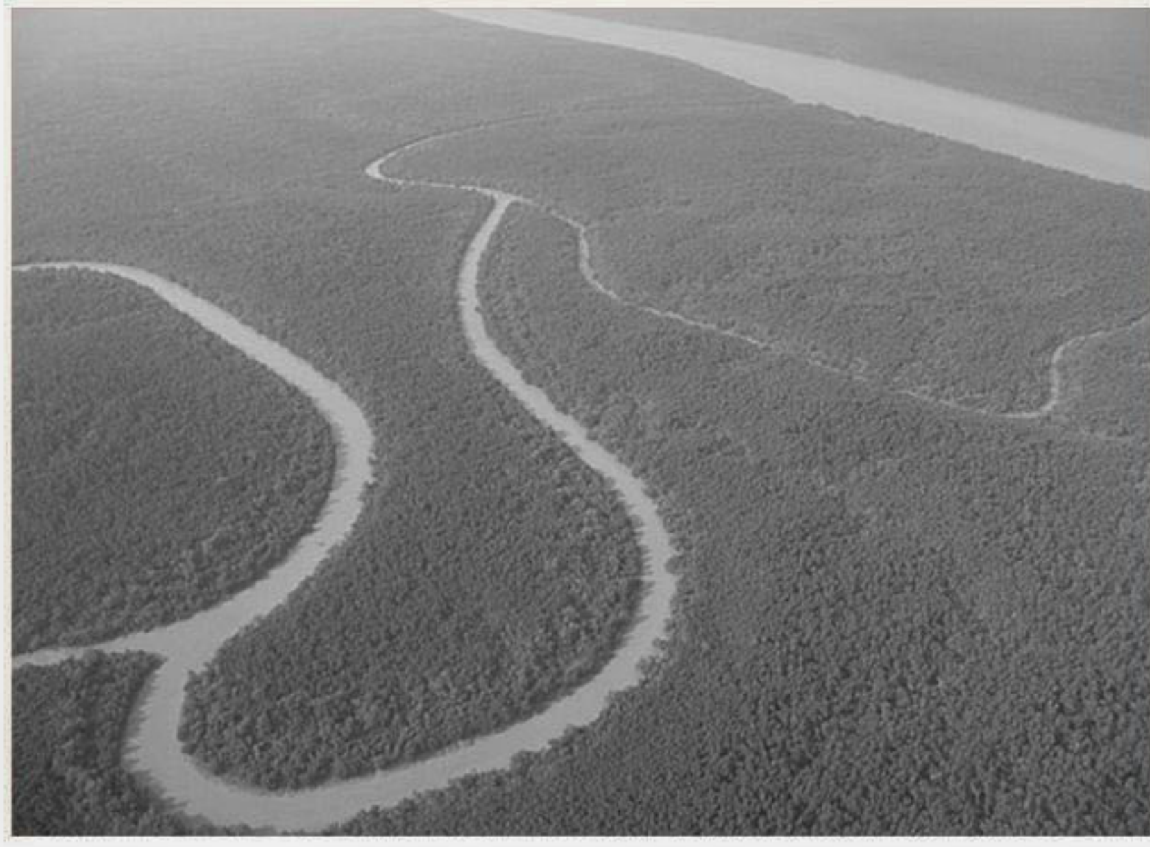
of the Sundarbans.

What happens to the oil that is spilled in the water? All oils, regardless of types, contain some volatiles. About 25% of the volatiles evaporate within three months, becoming an air pollutant. Nearly 60% of the remaining mass, relatively nonvolatile compounds that are lighter than water float on the surface, where they are broken down over the next few months by bacterial decomposition and photo-oxidation. The remaining 15% is a dense asphaltic substance that sticks together and sinks to the bottom in huge globs. It is these black, tarry lumps that will wash up on the banks