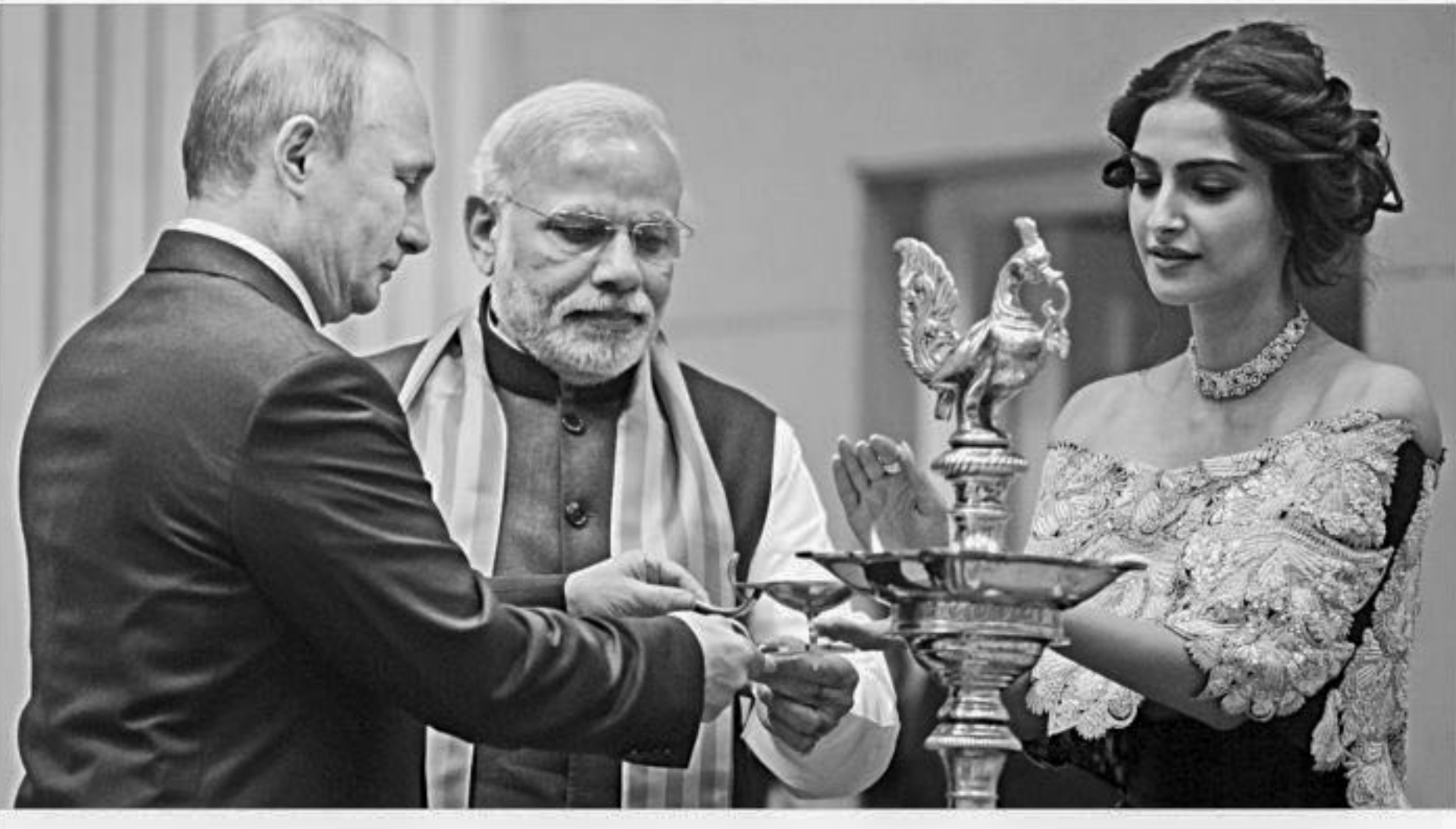
Russian President Vladimir Putin, Indian Prime Minister Narendra Modi and Bollywood actress Sonam Kapoor light an inauguration lamp at The World Diamond Conference at Vigyan Bhawan in New Delhi, yesterday.

"The importance of this relationship and its unique place in India's foreign policy will not change," he said. Modi, who swept to power promising to boost flagging growth, said energy security was "critical for India's economic development and creating jobs for our youth". "We have outlined an ambitious vision for nuclear