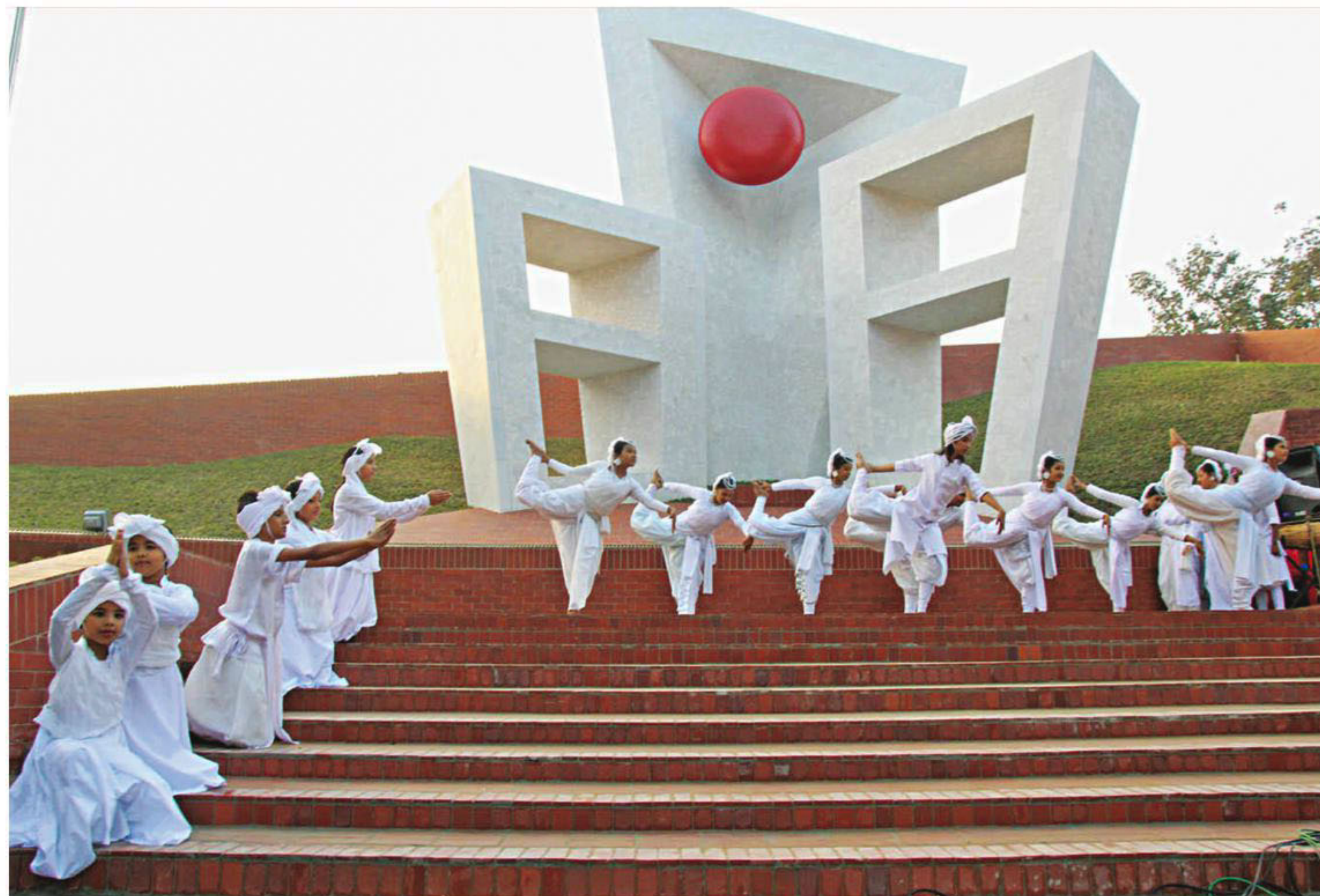
The newly built Central Shaheed Minar opens at Chouhatta in Sylhet city yesterday with artists performing a dance at a cultural programme there. Finance Minister AMA Muhith inaugurated the memorial erected by the city corporation at a cost of Tk 2 crore after the old one had been damaged by religious bigots in February 2013.