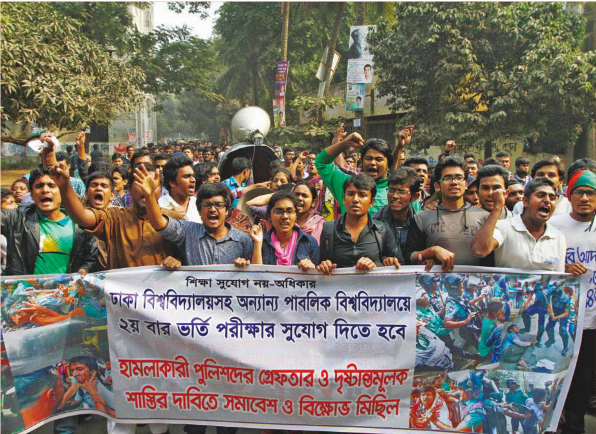
Demanding a chance to retake admission tests of Dhaka University and punishment for the law enforcers for attacking demonstrating aspirants, such candidates bring out a procession in front of TSC on the campus yesterday.

The law minister said no dialogue can take place with BNP leaders since its chief Khaleda Zia does not believe in the independence of Bangladesh and rule of law.