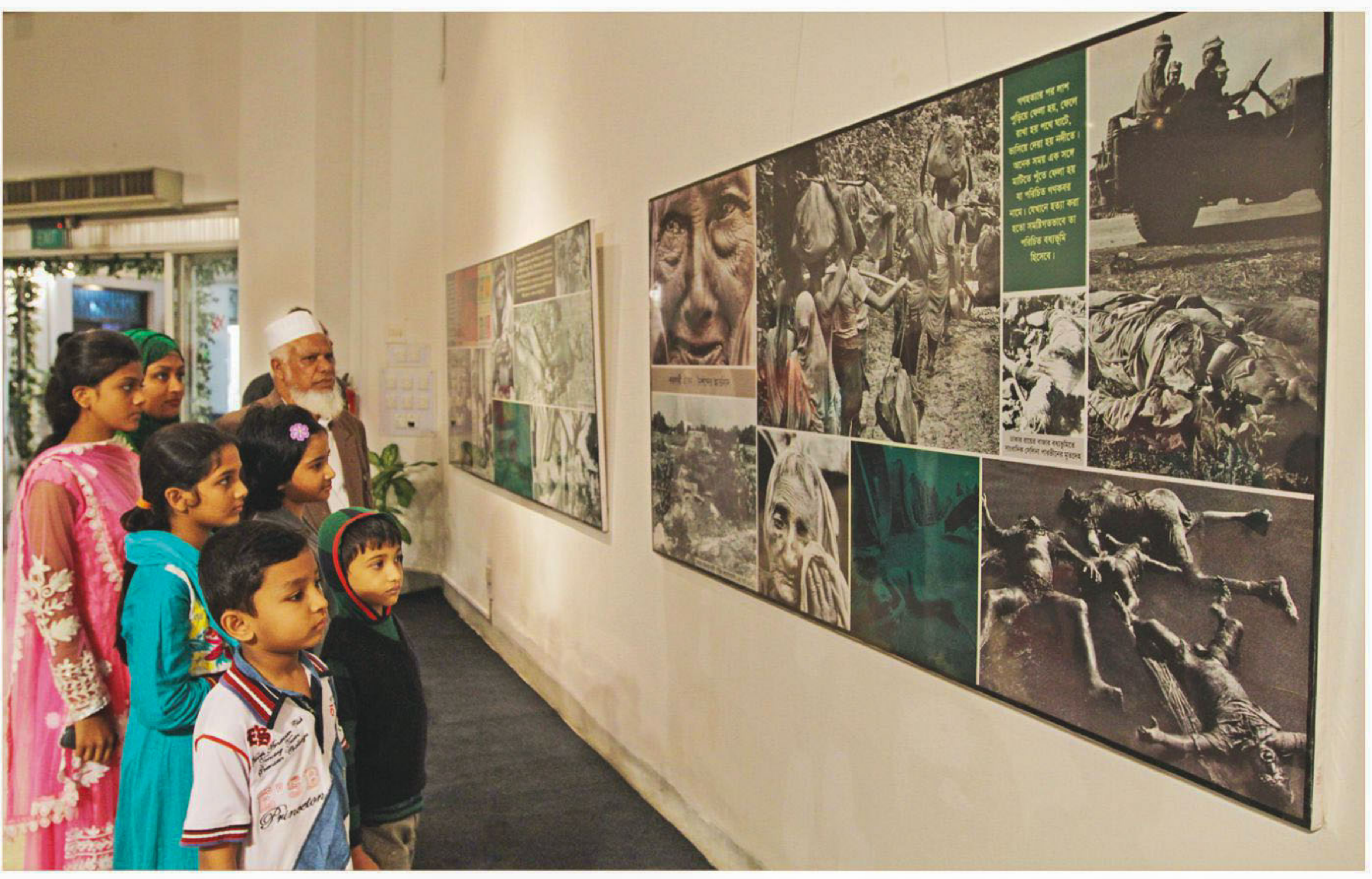
New and old both generations look at exhibits of "1971: Genocide and Torture", jointly organised by 1971: Genocide-Torture Archive and Museum Trust, and Bangladesh National Museum in the latter's Nalini Kanta Bhattasali auditorium yesterday. The exhibition will go on till December 16.

The court also fixed December 28 for hearing on charge framing against the 23 in the case.