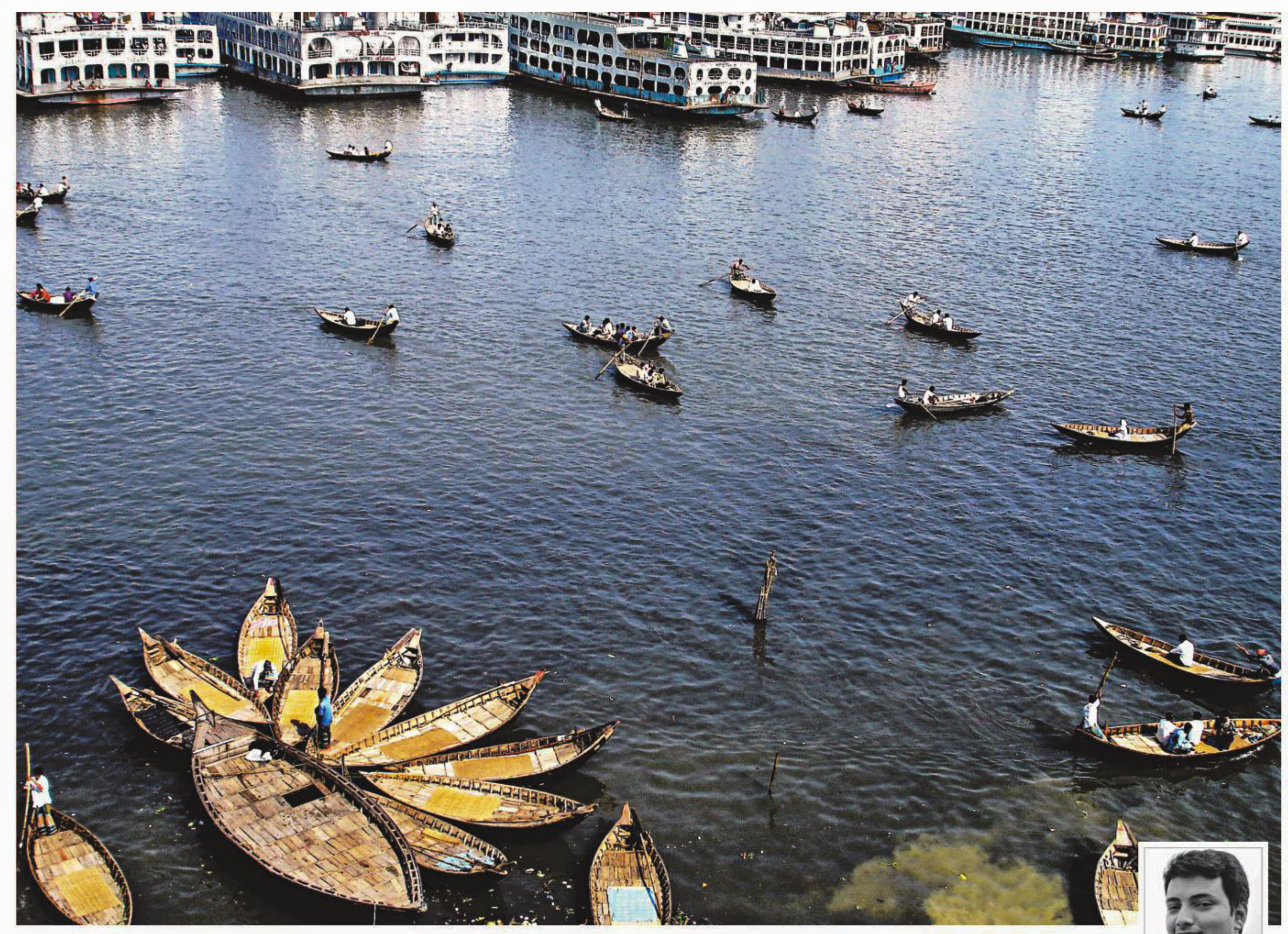
A teeming Buriganga off Sadarghat on the morning of April 4, 2005, captured by a finalist in the "Rivers of Bangladesh" category of The Daily Star's photo contest for amateurs, inPixel.