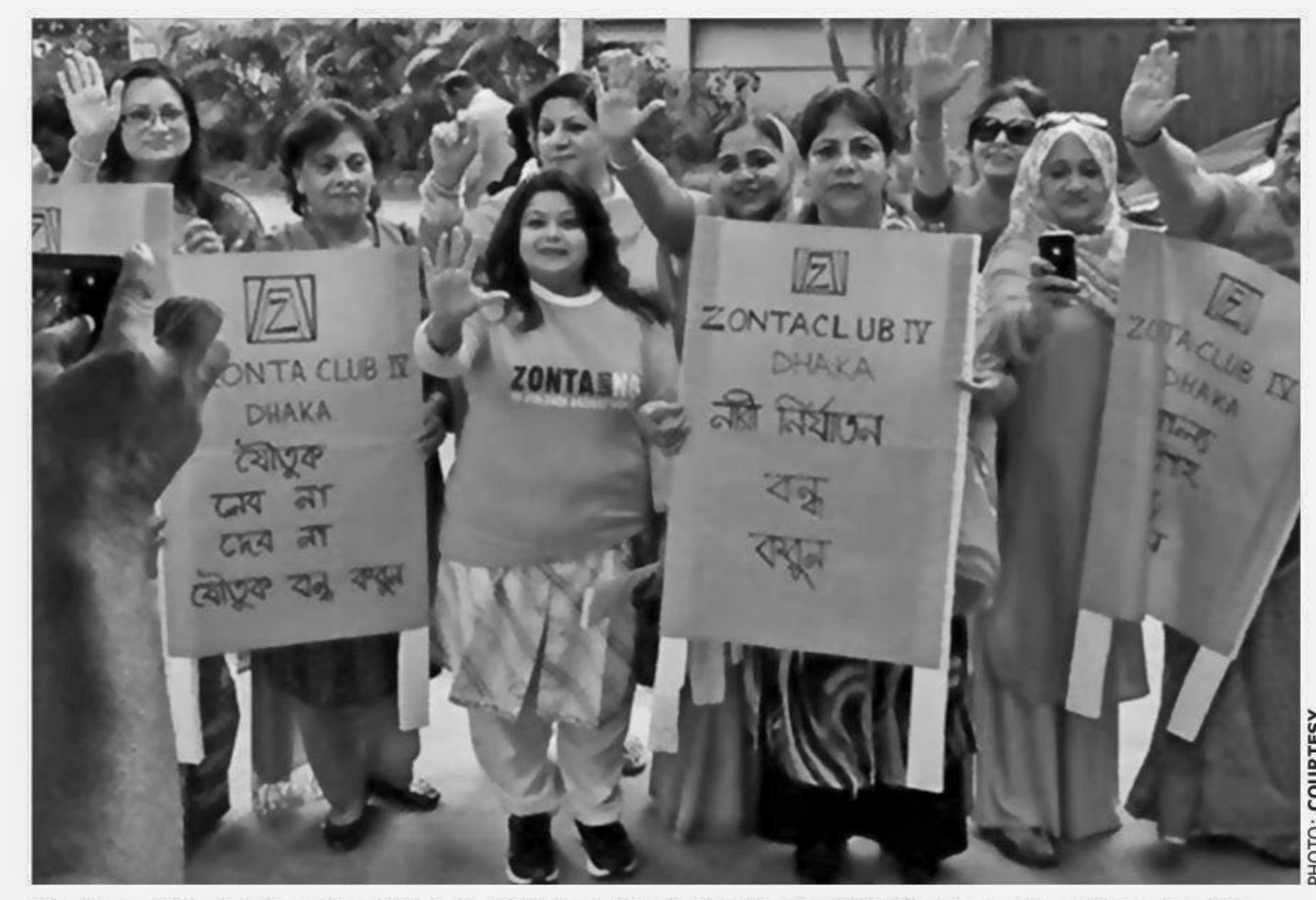
Members of Zonta International Club IV of Dhaka gather before the capital's Gulshan park on December 1 to raise awareness and increase action to end violence against women.