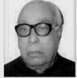
The 23rd death anniversary of Ataur Rahman Khan, a

former prime minister of Bangladesh and a veteran national leader, will be observed today.